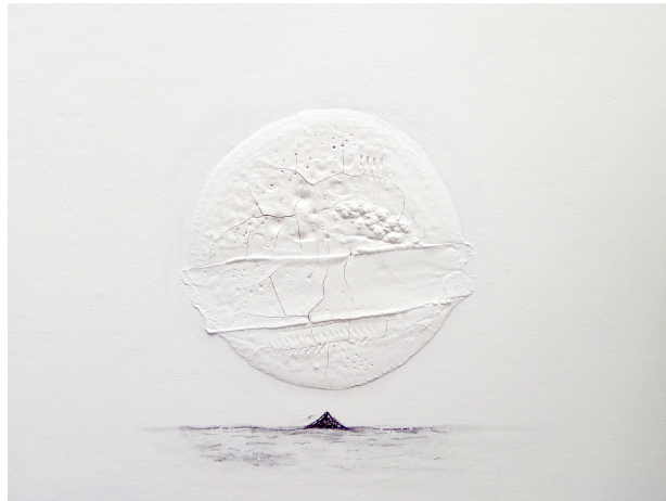
Claire LEE, White Sphere , 2014, mixed media on wood, 30 x 40 cm

I still remember visits to the Space Museum when I was little. I enjoyed lying down in darkness feeling pressured by the planets pushing in or pulling away from one another. It was frightening, along with an enigmatic pleasure of awe and wonder. This “planetary pressure” appears like a white giant sphere over the sky. I have no idea why this pressure, suffocating as it is, enchants me at the same time.