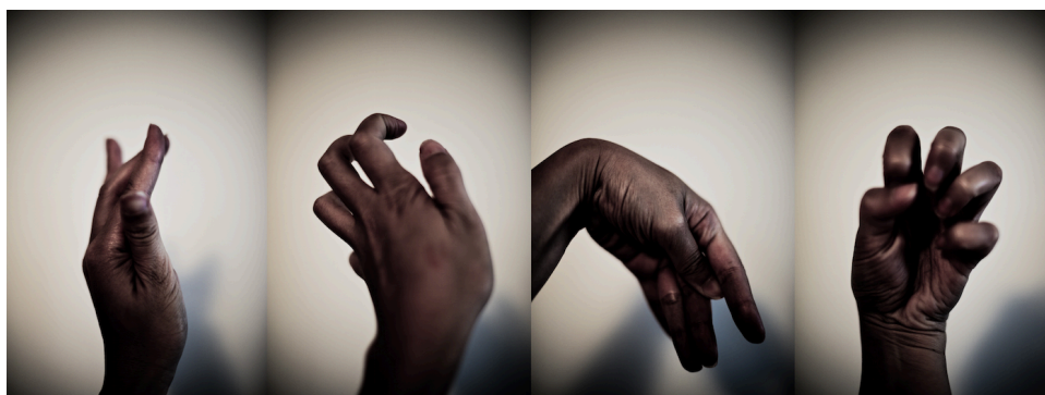
Claire LEE, Seizure , 2014, photographs, edition of 7, 42 x 29.7 cm each, set of 4

The tremors, twitching or jerking movements of bodies in epileptic seizure fascinate me. The grotesque and neurotic gestures remind me of organic forms in our nature. There is a deeply touching energy reflected from these uncomfortable shapes formed by the intense muscles.