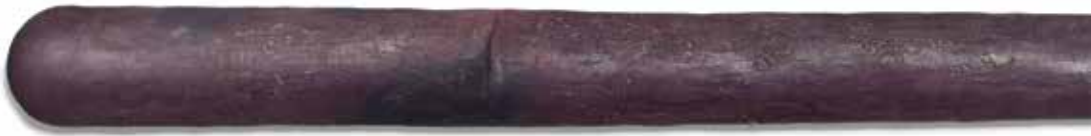
Purple File, 1966

Sculptmetal and paint on screen, wood armature, 6½ x 120 x 3 inches