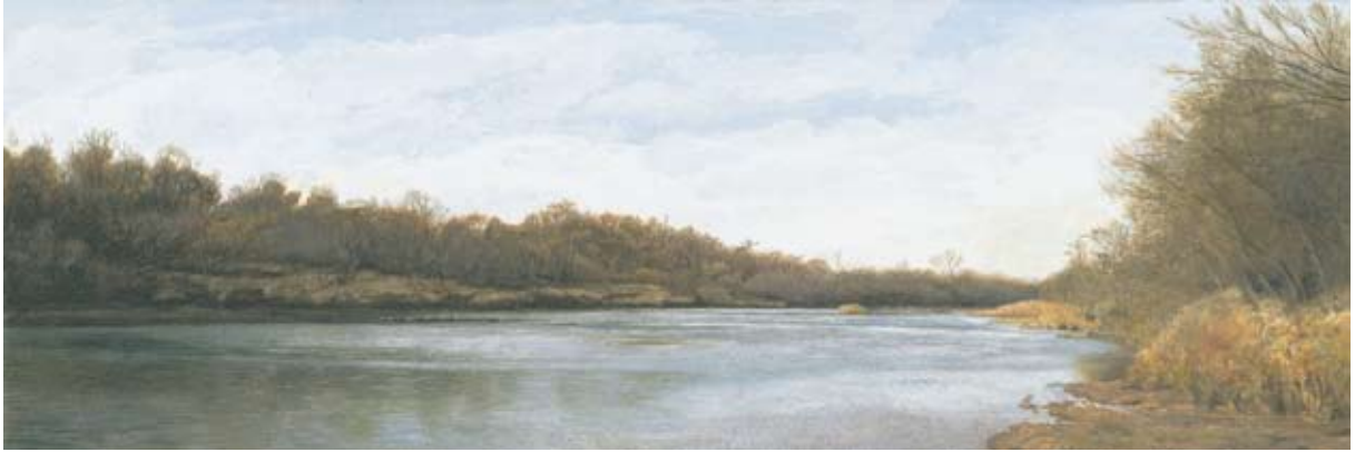
BRAZOS FALL, 2005 Giclee print from watercolor, 9 x 27 in. (22,9 x 68,6 cm)