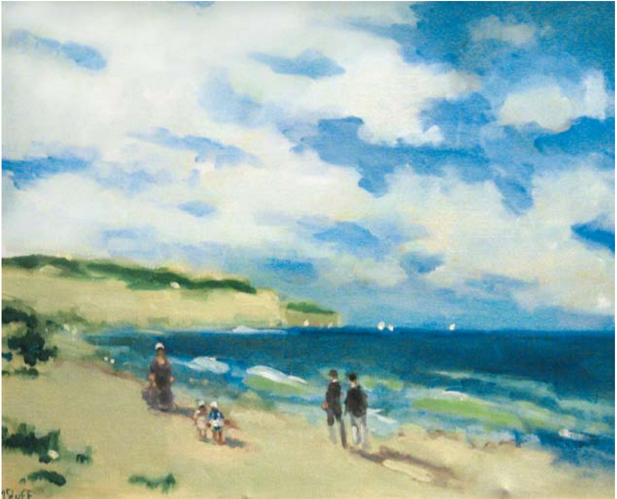
DEEP BLUE SEA , undated Oil on canvas, 25 x 29 in. (63,5 x 73,7 cm) Gift of The Venable Neslage Galleries to the ART in Embassies Program, Washington, D.C.