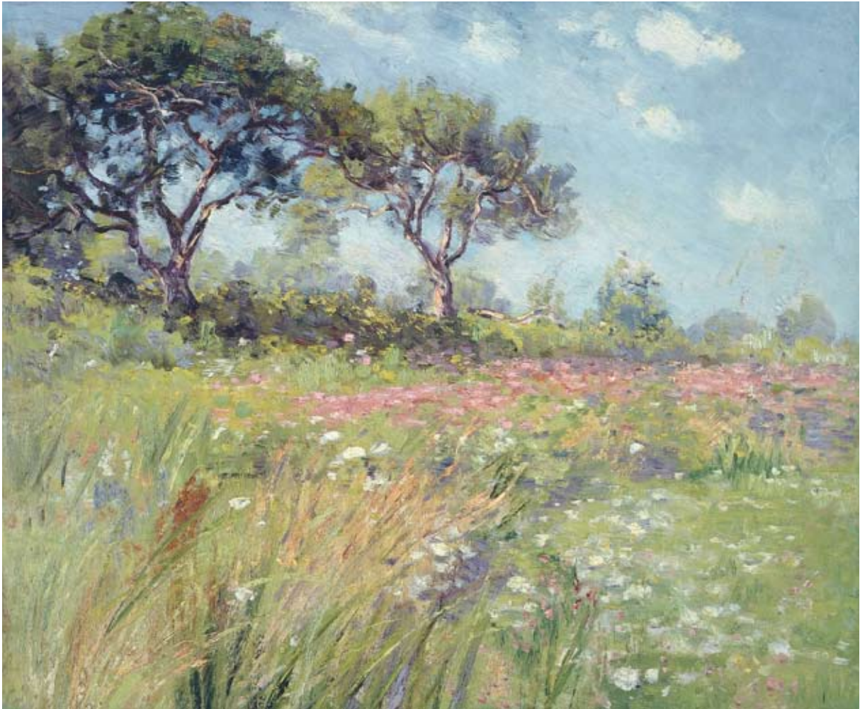
LIGHT BREEZE , c.1917 Oil on panel, 20 x 24 in. (50,8 x 61 cm)