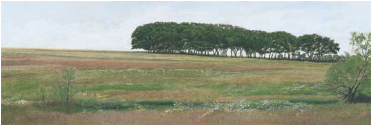
SILVER CREEK, 2004 Giclee print from watercolor, 9 x 27 in. (22,9 x 68,6 cm)