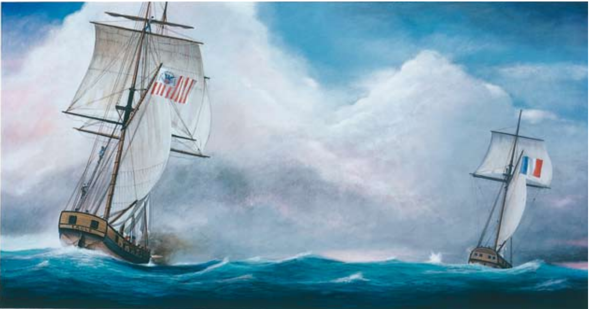
REVENUE CUTTER EAGLE CAPTURES BON PÈRE , 1990 Oil on canvas, 27 x 50 in. (68,6 x 127 cm)