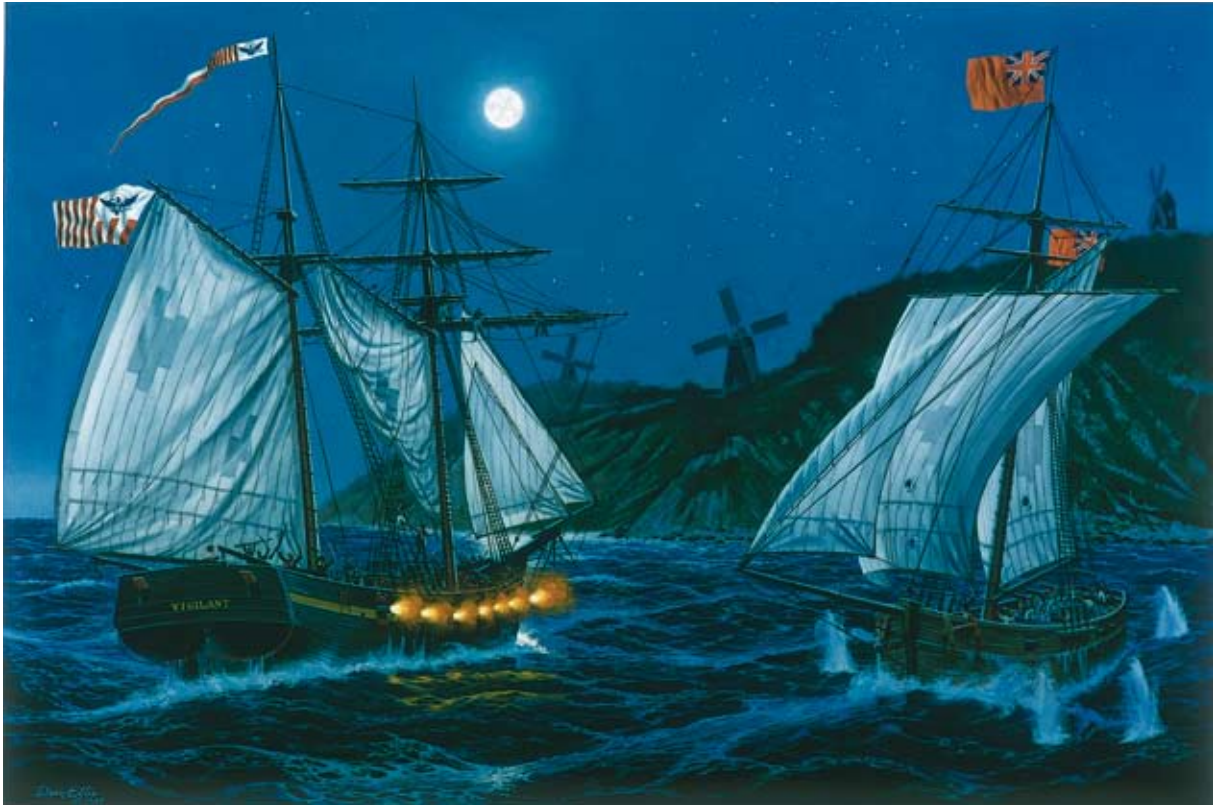
THE DEFEAT OF THE PRIVATEER DART, 1990 Oil on canvas, 36 ½ x 50 ½ in. (92,7 x 128,3 cm) Courtesy of the United States Coast Guard, Washington, D.C.