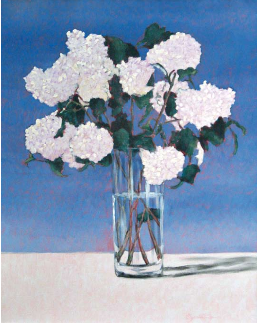
WHITE "SNOWBALL" VIBURNUM, 1991

Oil on canvas, 37 1/2 x 31 in. (95,3 x 78,7 cm). Courtesy of the artist, Middleburg, Virginia