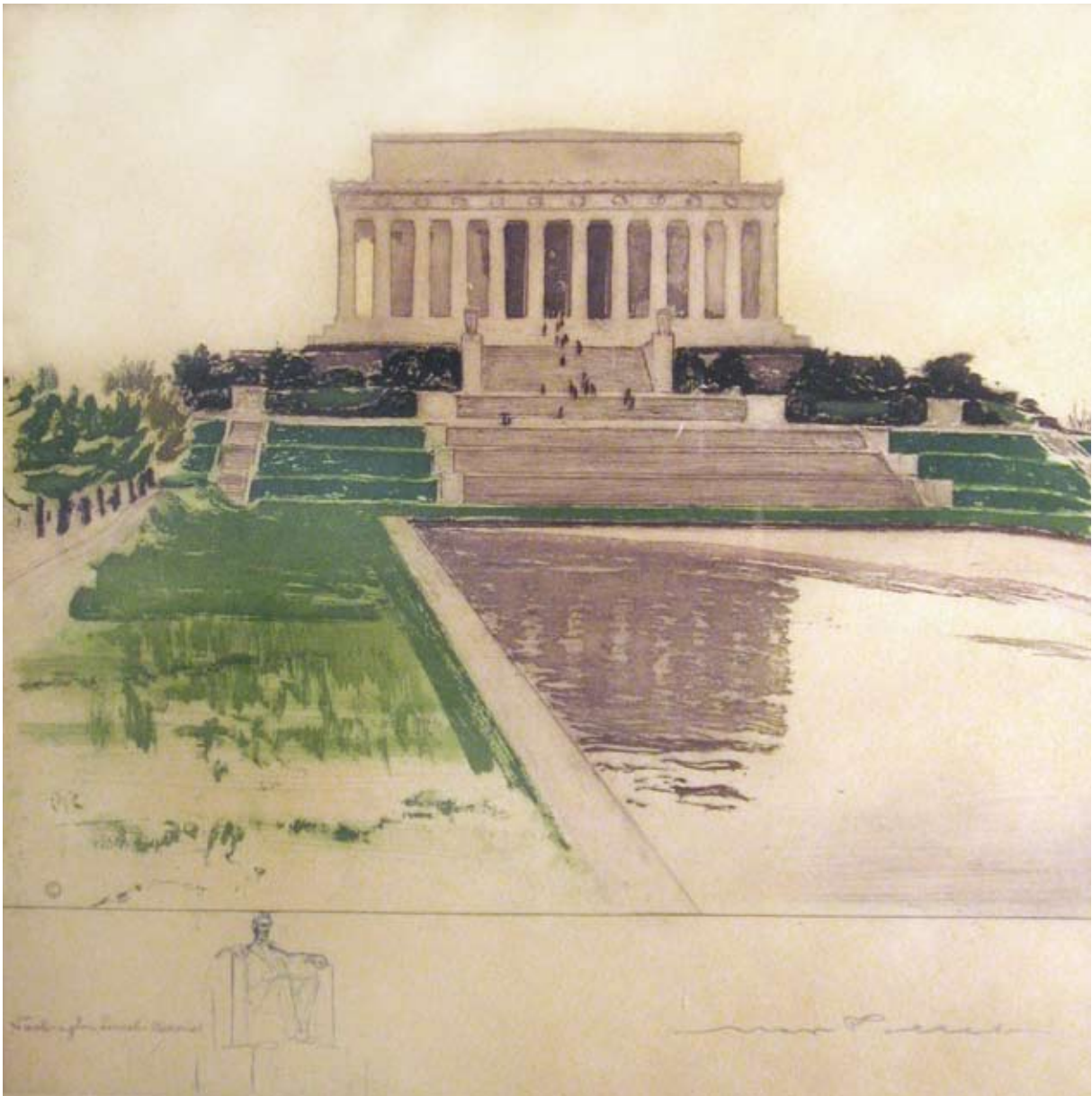
WASHINGTON, LINCOLN MEMORIAL, undated Ink and wash on paper, 26 1/8 x 22 in. (66.4 x 55.9 cm)