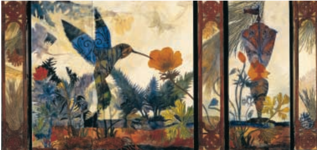
The Covered Cup , printed papers, paint, canvas, 1996, 30 x 60 in. (76.2 x 152.4 cm), lent by the artist, Seattle, Washington.