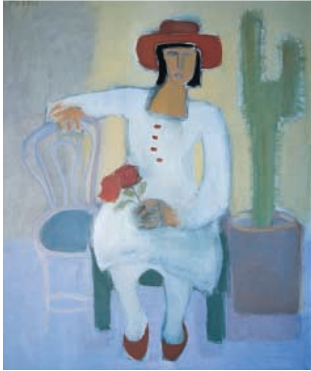
Waiting , oil on canvas, undated, 52 x 44 in. (132.1 x 111.8 cm), lent by the artist, Katonah, New York.