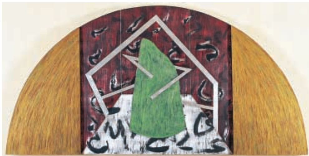
Rockscape Altarpiece #2 , oil and acrylic on aluminum and wood, 1991, 60 x 36 x 1.5 in. (152.4 x 91.4 x 3.8 cm), lent by the artist, McLean, Virginia.