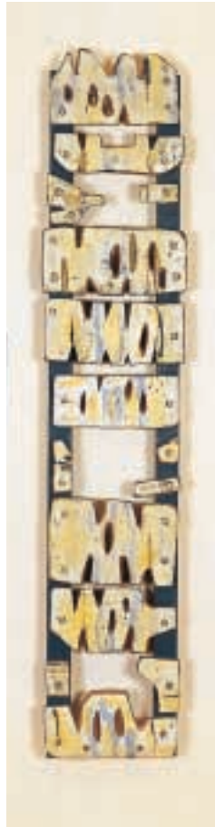
Ceramic Wall Puzzle , glazed terra-cotta, metal screws, and painted wood, n.d., 50 x 10 in. (127 x 26 cm), private collection.