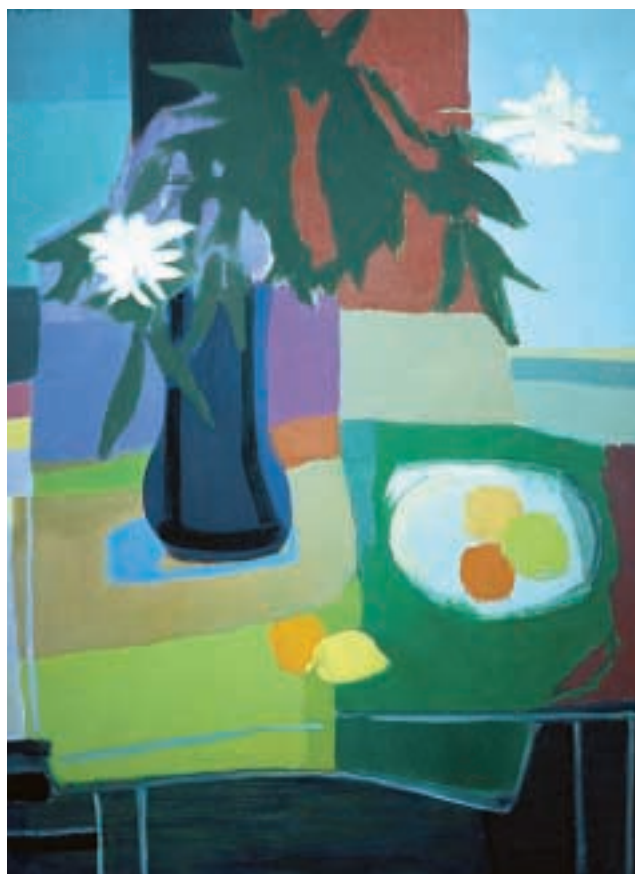
Peonies , oil on canvas, undated, 51 x 38 in. (129.5 x 96.5 cm), lent by the artist, Katonah, New York.