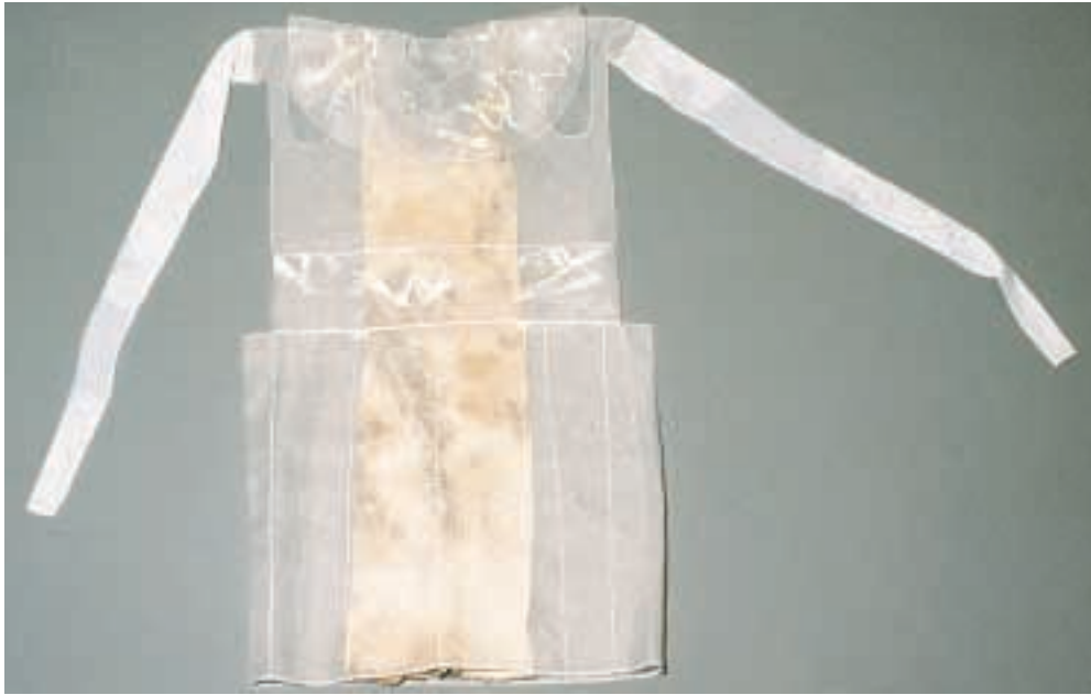
The Newspaper Dress with Ornamental Sleeves , silk organza with newspaper collage and embroidery, 1999, 45 x 72 in. (114.3 x 182.9 cm), lent by the artist, Esopus, New York.