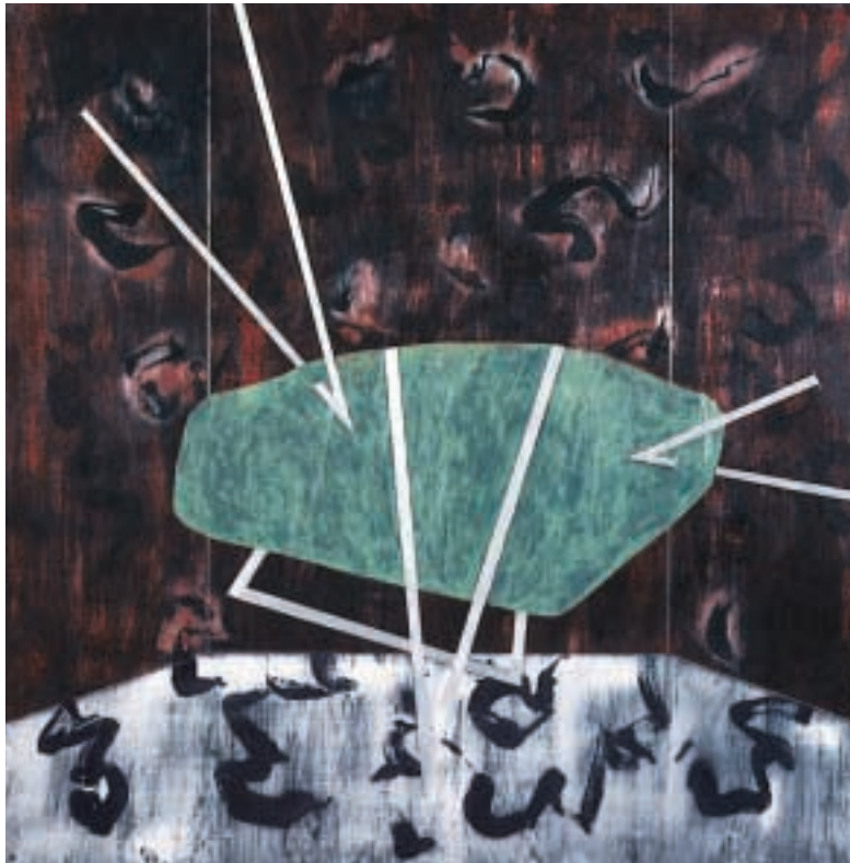
Kami Series , oil and acrylic on aluminum and wood, 1989, 36 x 36 x 1.5 in. (91.4 x 91.4 x 3.8 cm), lent by the artist, McLean, Virginia.