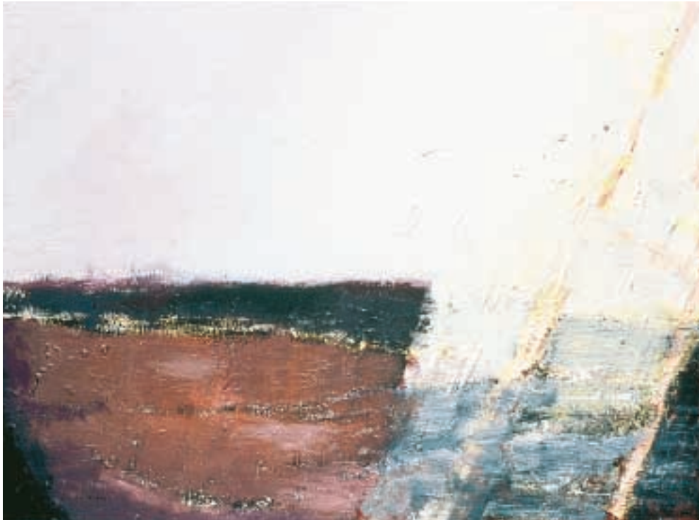
Divided Light # 18 , acrylic on linen, 1996, 36 x 48 in. (91.4 x 121.9 cm), lent by the artist, Bethesda, Maryland.

A landscape abstractionist, Korean-born Su Kwak has been mentioned in the same breath with classic Northern Romantic thinking which dictated that the artist was to master “a religion of his own, to express an original view of the infinite,” the infinite being the equivalent of nature. The contrast of light and dark is readily evident in her paintings.