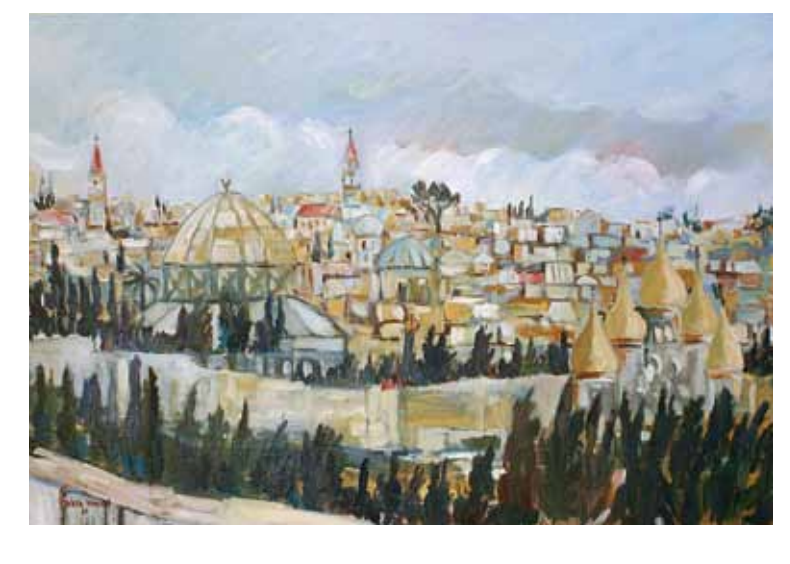
Cityscape, undated Oil on canvas, 37 ½ x 39 ½ in. (95,3 x 100,3 cm)