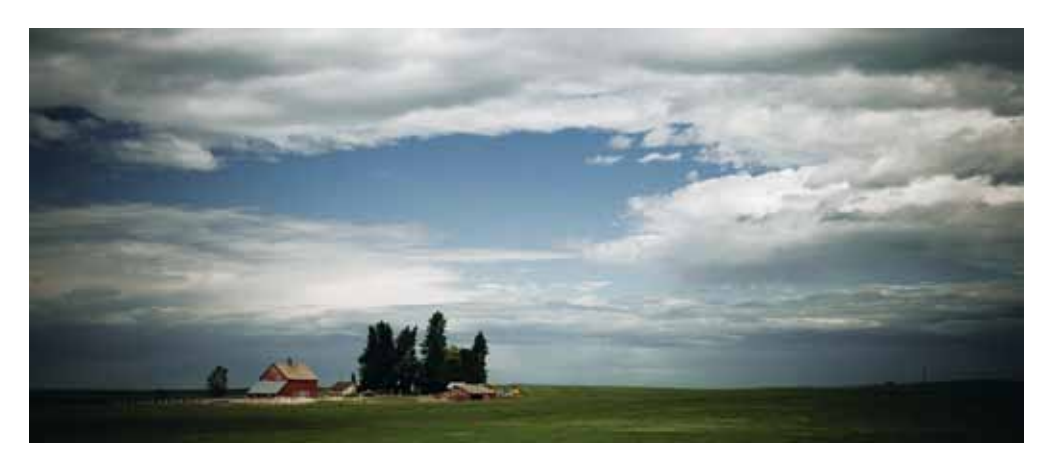
Under the Spotlight, undated. Inkjet on watercolor, 21 1/8 x 42 1/8 in. (55,6 x 108,9 cm).