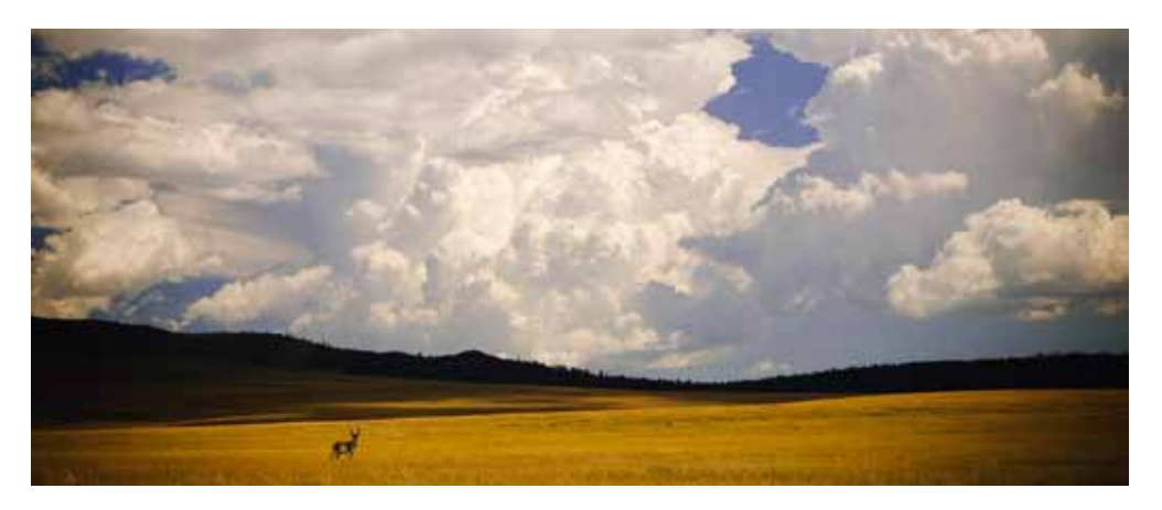
Watching, undated. Inkjet on watercolor, 21 1/8 x 42 1/8 in. (55,6 x 108,9 cm). Courtesy of the artist, Studio City, California