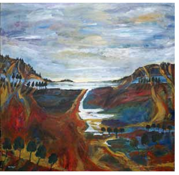
The Dam, undated Oil on canvas, 48 x 48 in. (121,9 x 121,9 cm)