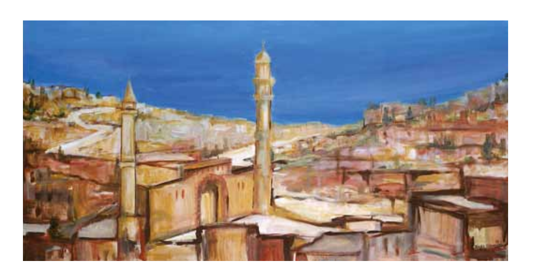
The Mosque, undated Oil on canvas, 24 x 48 in. (61 x 121,9 cm)