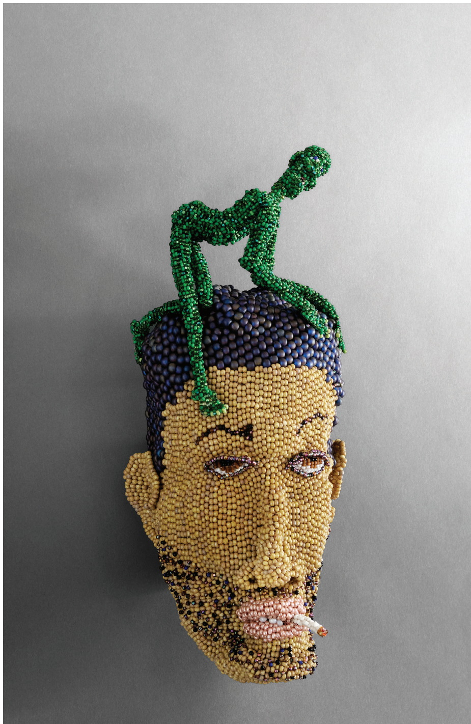
Later Baby, 2008 Glass beads, thread 10.75 x 4.125 x 3.75 inches