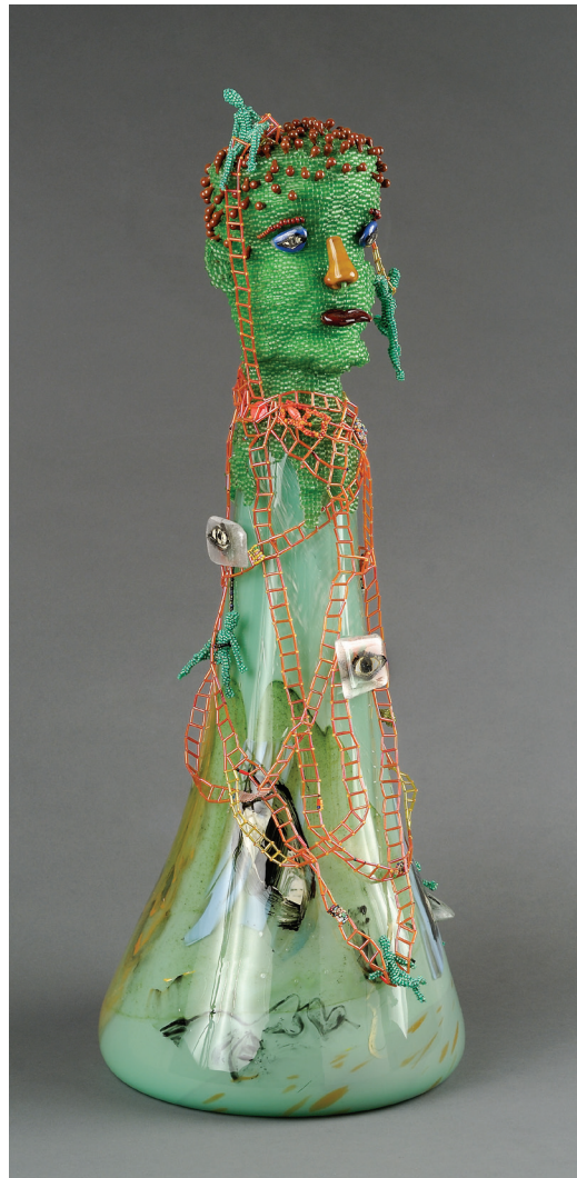
Celadon II, 2010 Blown, fused, painted and flame worked glass, glass beads, thread, wire 30 x 10 x 10 inches