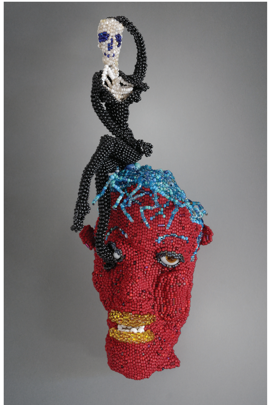
From the Day After Rape series: Suicide, 2003-2010 Glass beads, thread 9.125 x 3.25 x 2.75 inches