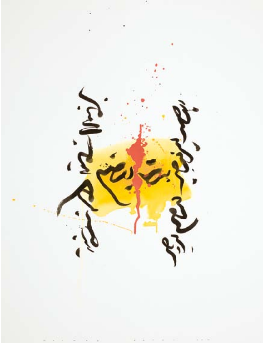
Untitled , 2010. Mixed media on paper, 65 x 50 cm.