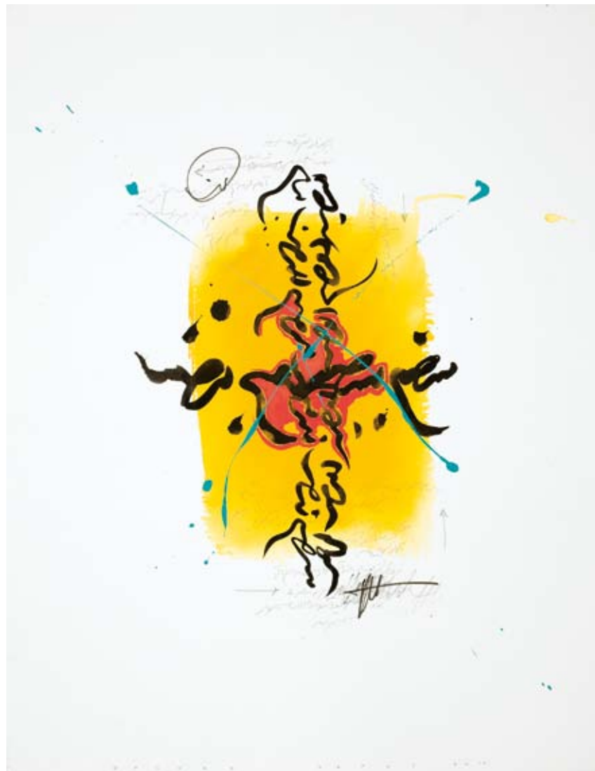
Untitled , 2010. Mixed media on paper, 65 x 50 cm.