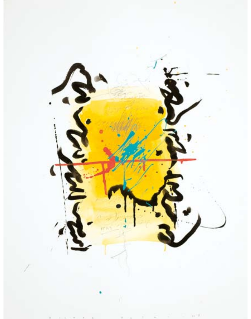
Untitled , 2010. Mixed media on paper, 65 x 50 cm.