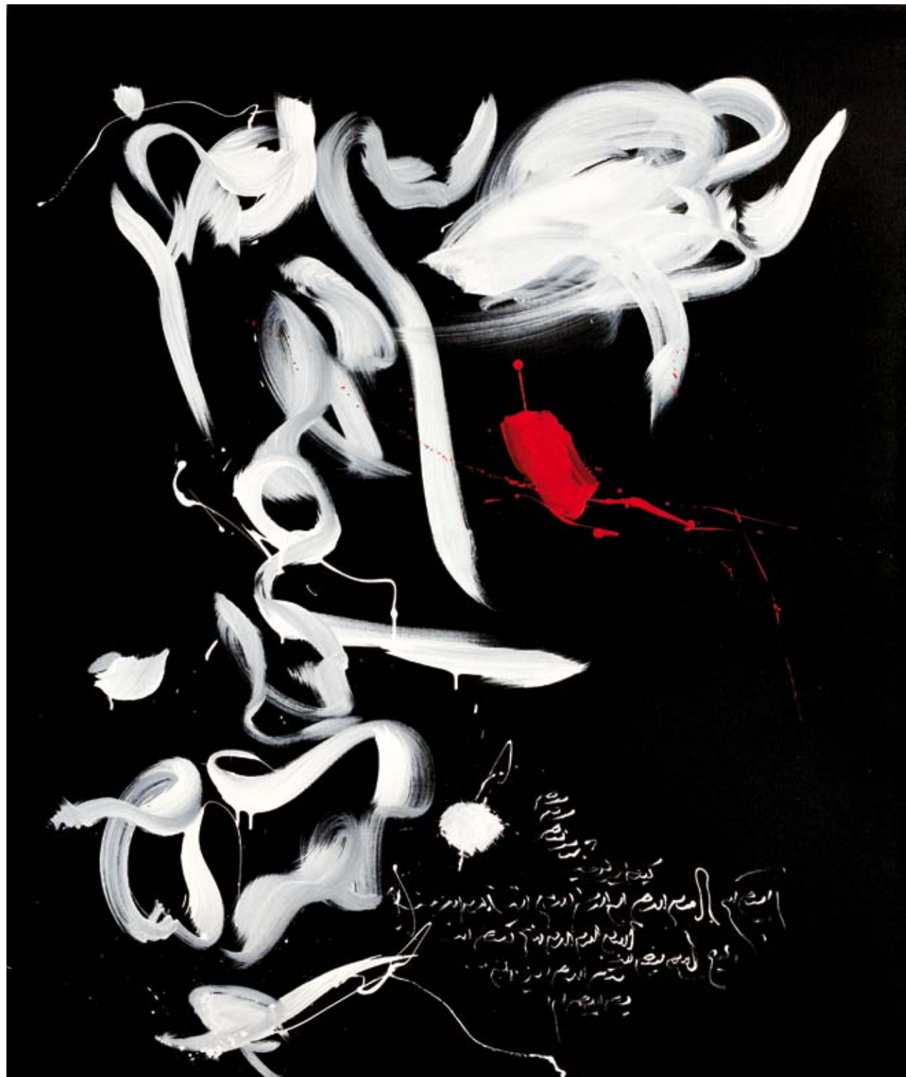
Untitled, 2010. Acrylic on canvas, 170 x 142 cm.

'Nothing is yours. What is it you can't decide? Why are you fighting?' - Rumi