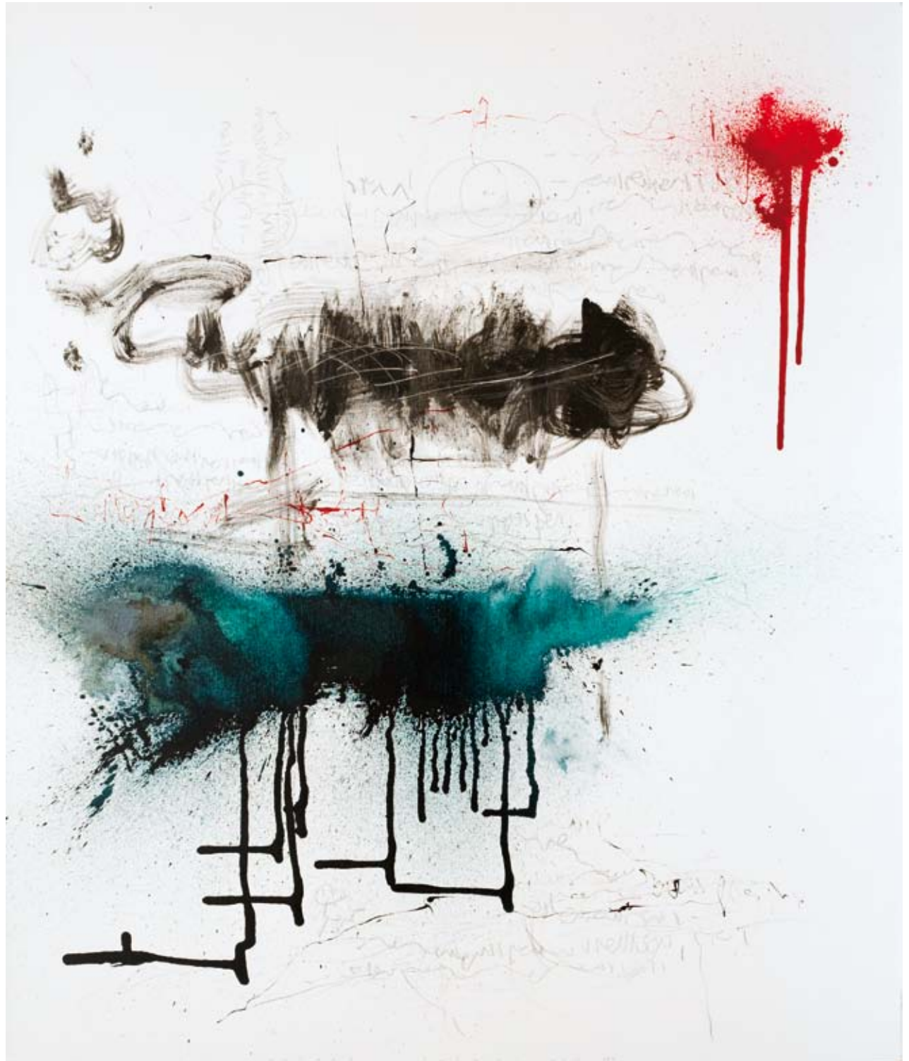
Untitled , 2010. Acrylic on canvas, 170 x 142 cm.