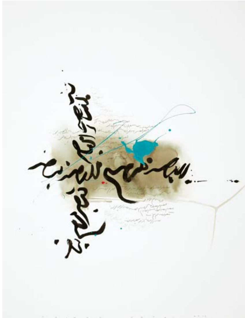
Untitled , 2010. Mixed media on paper, 65 x 50 cm.