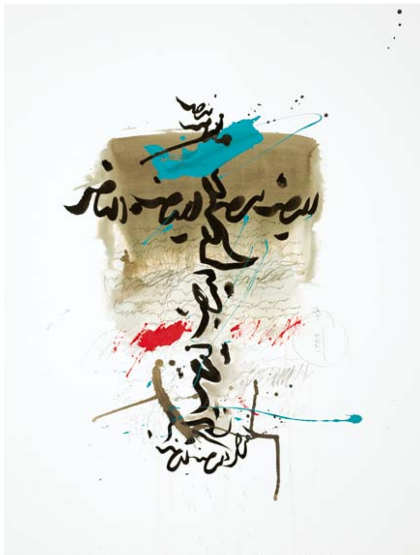
Untitled , 2010. Mixed media on paper, 65 x 50 cm.