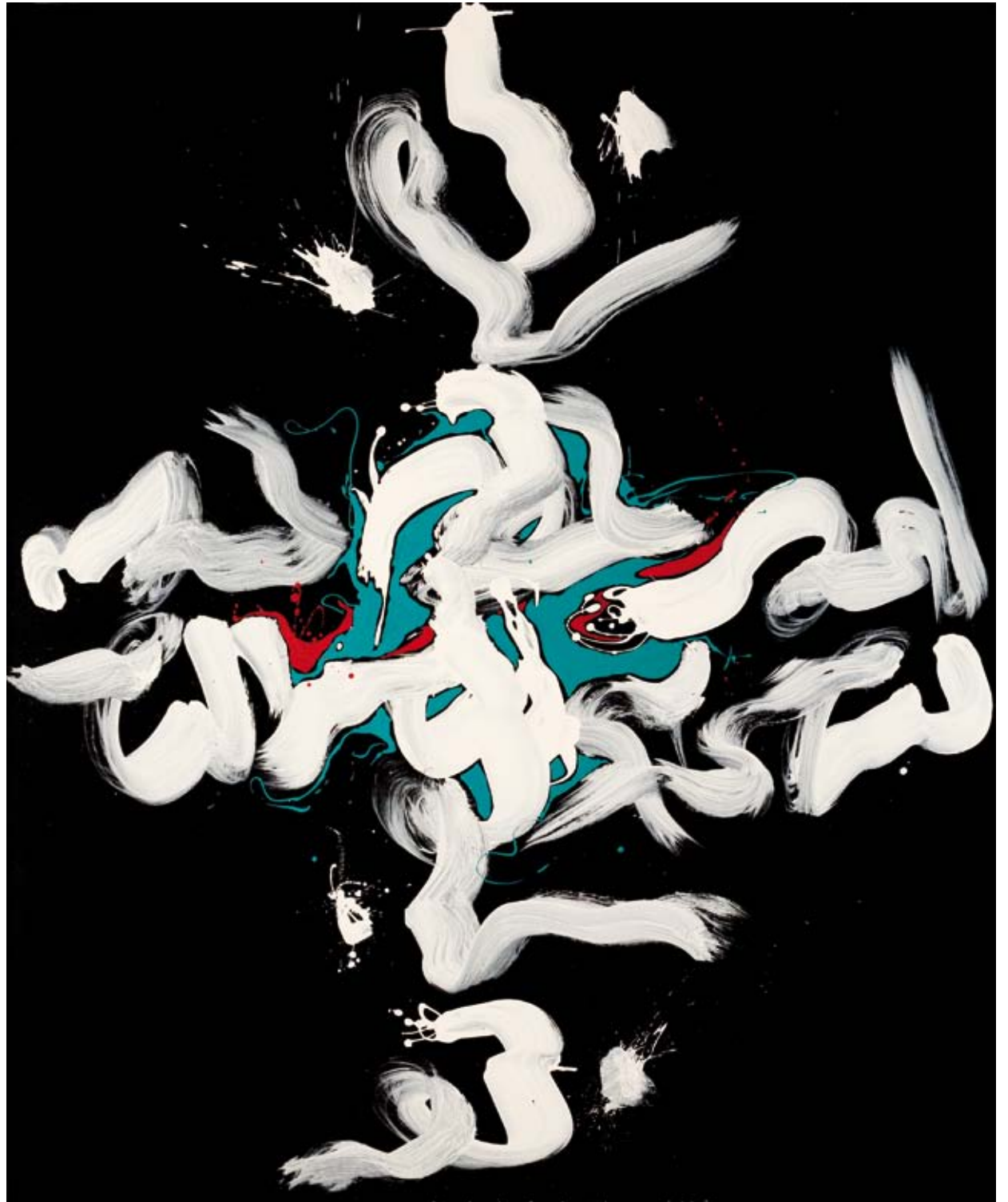
Untitled, 2010. Acrylic on canvas, 170 x 140 cm.

Does it need to be read? I doubt it... The forms fascinate me more! They are woven into each other, they have become one!