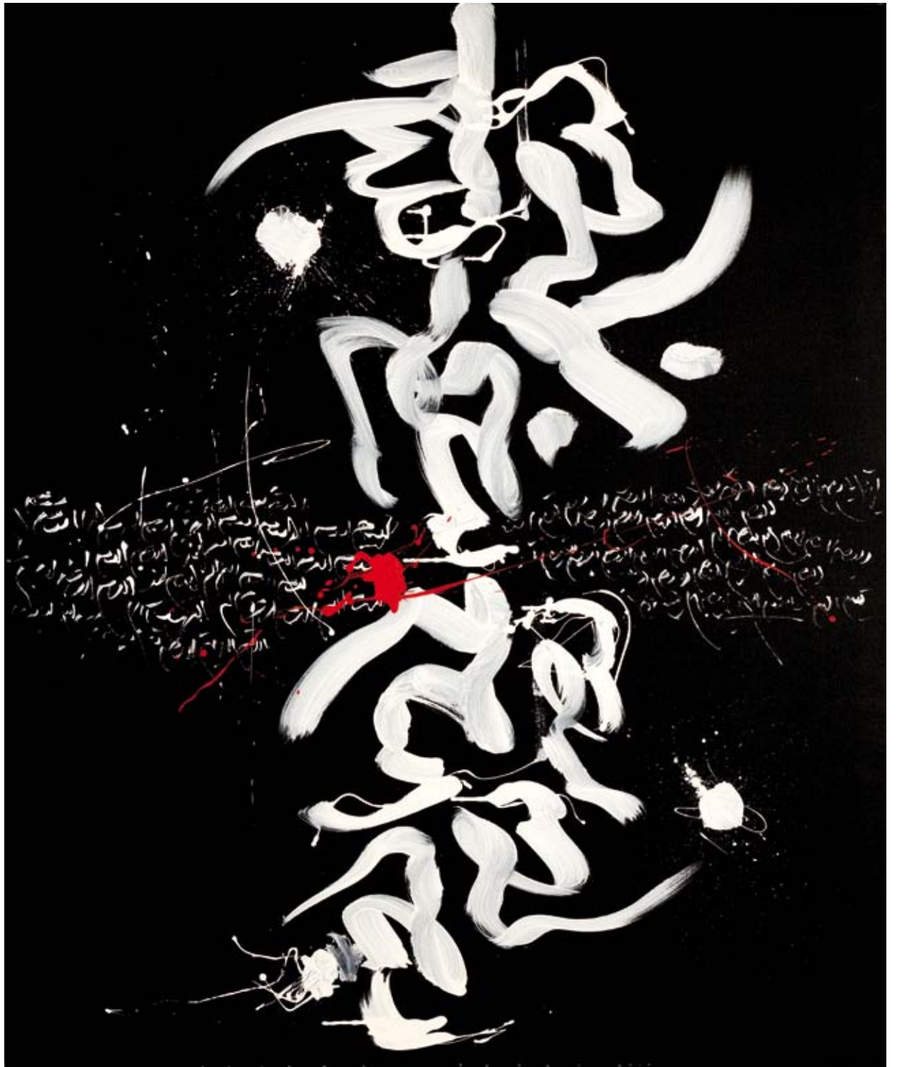
Untitled , 2010. Acrylic on canvas, 170 x 142 cm.

What did I learn yesterday? What did I gain today? I need to break some rules that I learned.