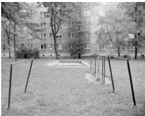
Untitled #1-5, from in (and against) time, 2009 silver gelatin photographs, 32 x 40 cm each

opposite page: Maps (detail), 2009 pencil wall drawing, dimensions variable