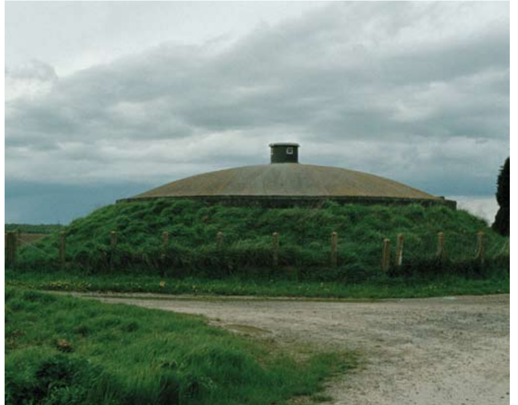
Untitled #1-2 from à la dérive , 2009 lamda photographs 76 x 76 cm, 76 x 95 cm