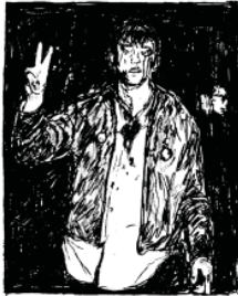
PUBLISHED BY THE COLUMBIA STRIKE COMMITTEE Price: 25 cents