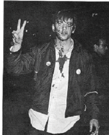
PUBLISHED BY THE COLUMBIA STRIKE COMMITTEE Price: 25 cents