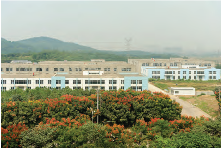
Untitled #12 - 2012 Archival Inkjet print 90 x 130 cm / Edition of 5