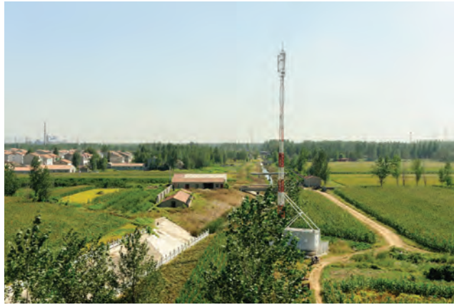
Untitled #5 - 2012 Archival Inkjet print 90 x 130 cm / Edition of 5