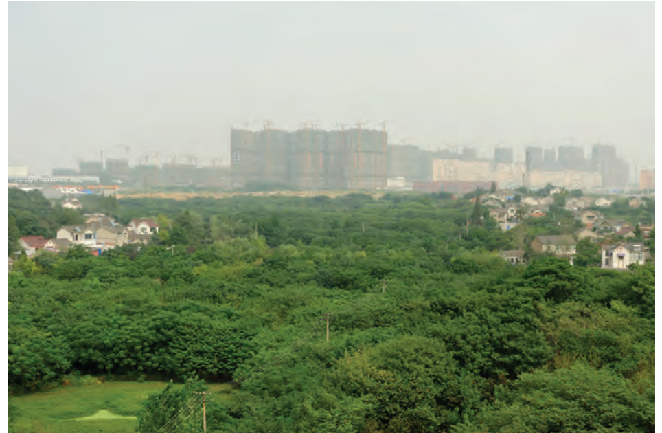
Untitled #14 - 2012 Archival Inkjet print 90 x 130 cm / Edition of 5