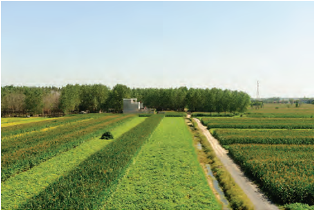
Untitled #3 - 2012 Archival Inkjet print 90 x 130 cm / Edition of 5