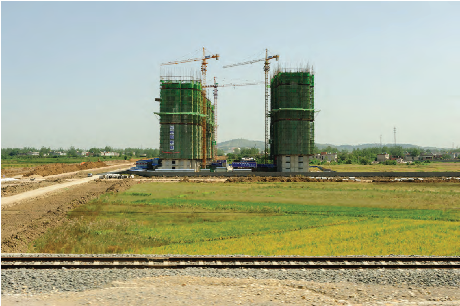
Untitled #11 - 2012 Archival Inkjet print 90 x 130 cm / Edition of 5