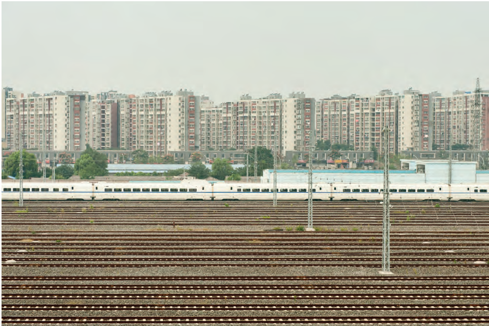
Untitled #15 - 2012 Archival Inkjet print 90 x 130 cm / Edition of 5