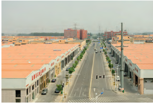
Untitled #19 - 2012 Archival Inkjet print 90 x 130 cm / Edition of 5