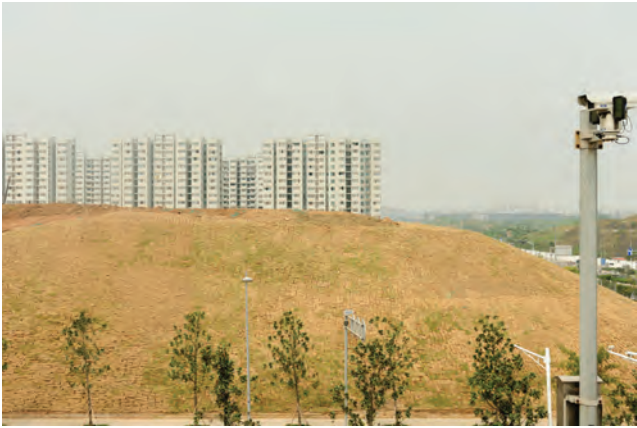
Untitled #17 - 2012 Archival Inkjet print 90 x 130 cm / Edition of 5