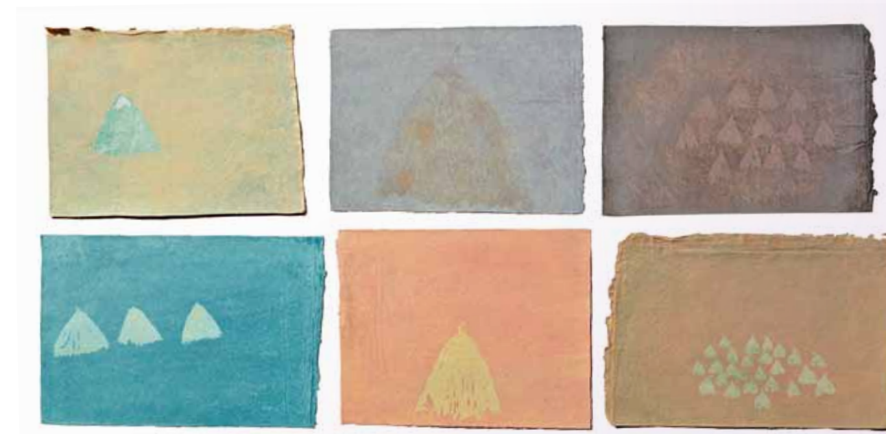
Acrylic on paper, 2011, set of 6 panels 9.5 x 14 in (each)

2008: Bachelor of Fine Arts, Faculty of Fine Arts, Maharaha Sayajirao University, Baroda