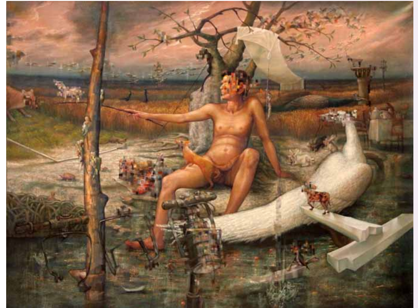
Oil on canvas, 2011 - 2012, 60 x 76 in

2005: Bachelor of Fine Arts, College of Art, New Delhi