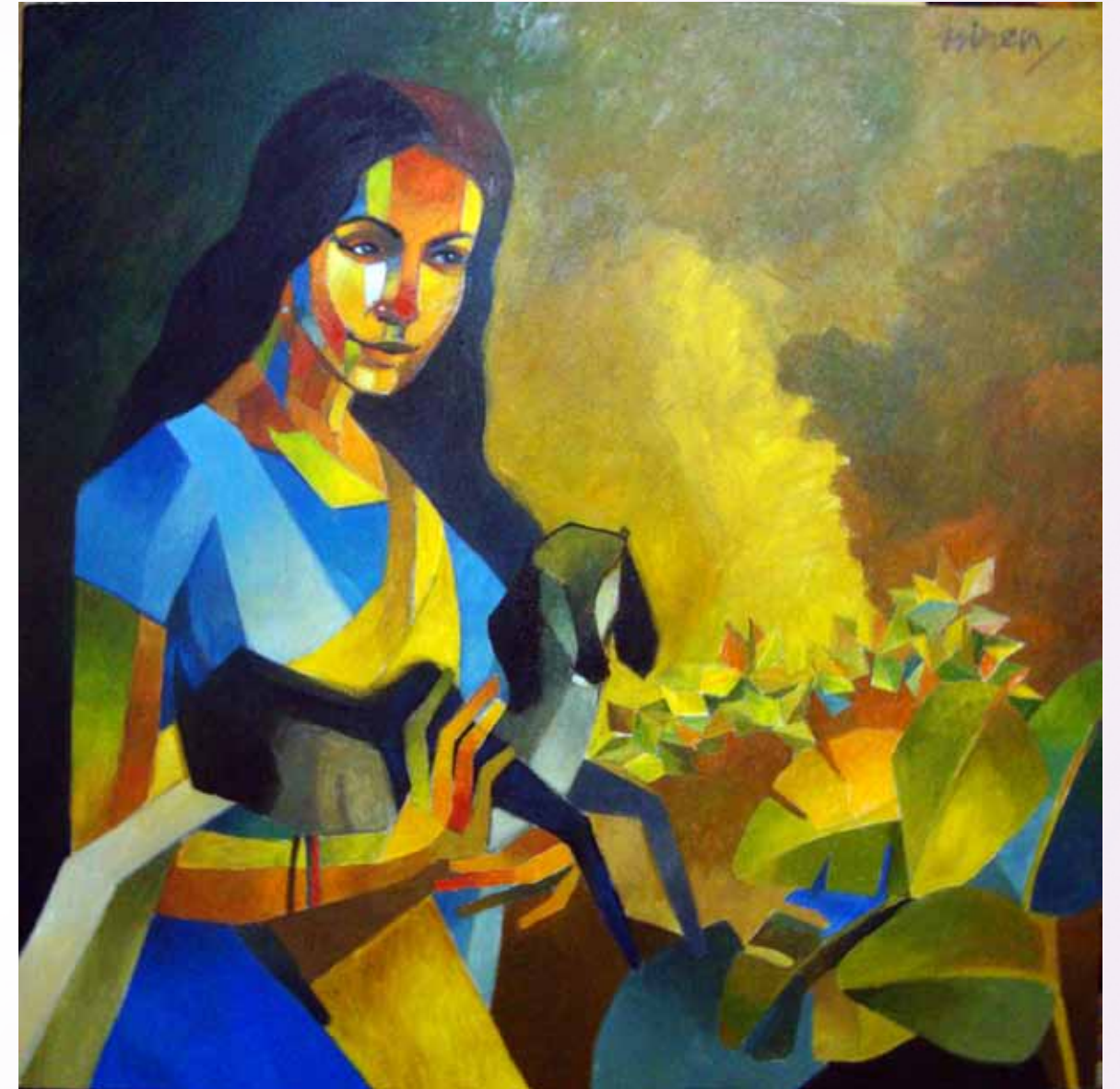
Oil on canvas, 2011, 36 x 36 in

1965: Graduate in Arts, Government College of Art & Crafts, Kolkata