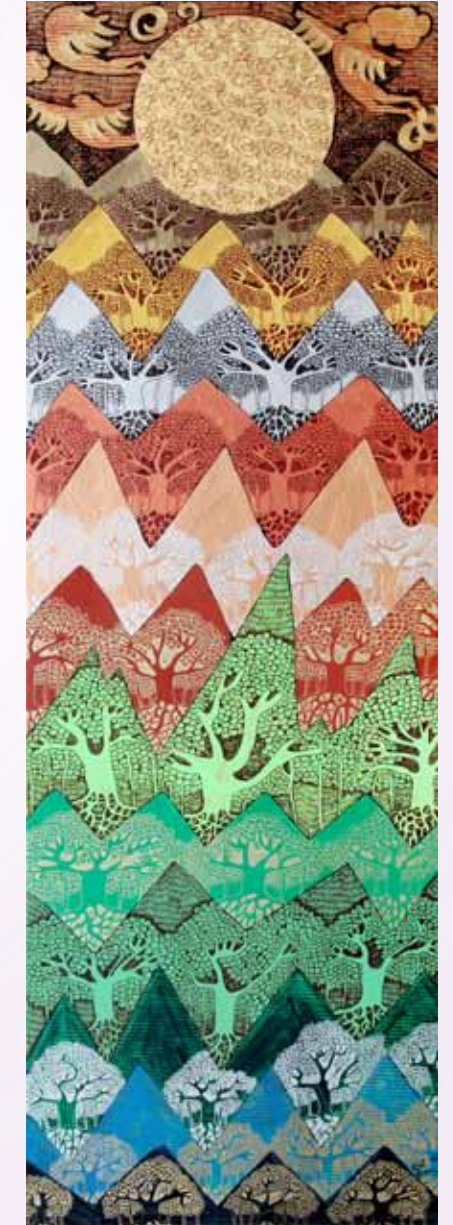
B) Mixed media on canvas, 2011, 72 x 24 in