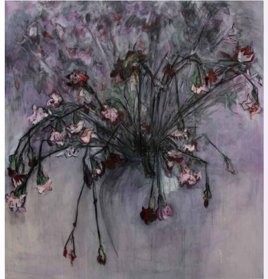
Mixed media on canvas, 2010, 62 x 58 in

1996: Graduate in Architecture, School of Planning & Architecture, New Delhi