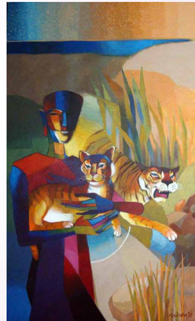
Acrylic on canvas, 2011, 60 x 36 in

1965: Graduate in Arts, Government College of Art & Crafts, Kolkata