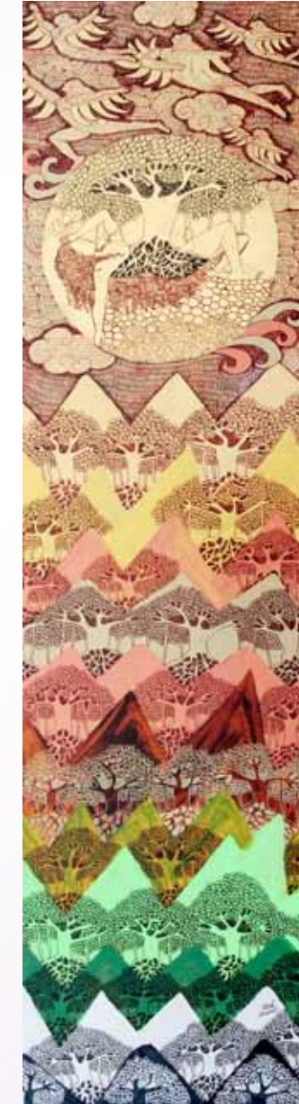
A) Mixed media on canvas, 2011, 72 x 18 in