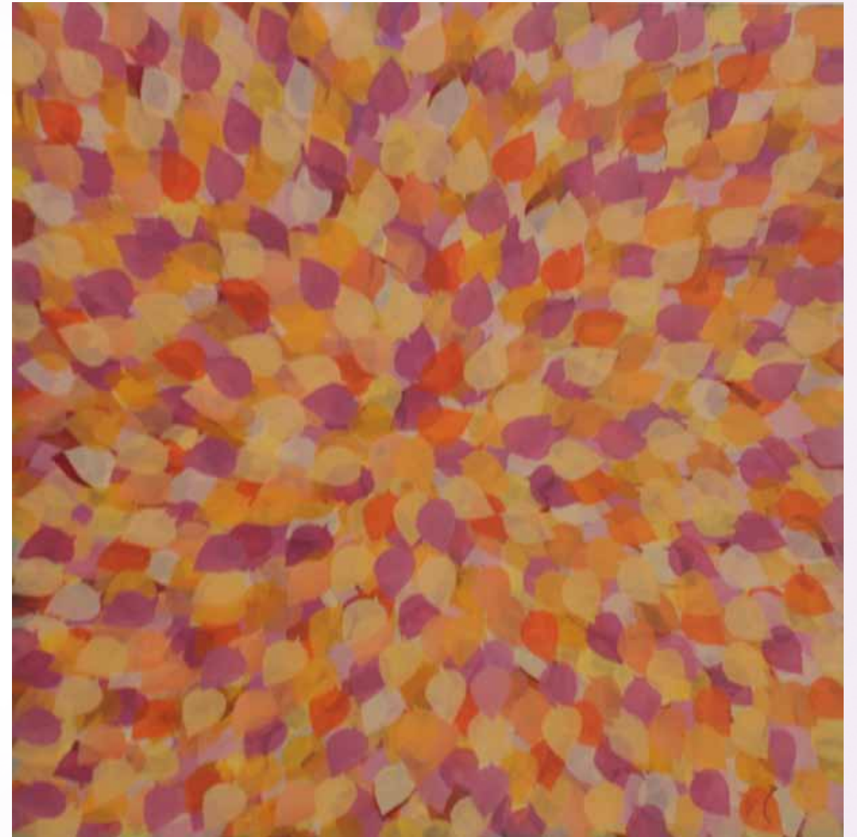
Acrylic on canvas, 2012, 48 x 48 in

1996: Specialization in Graphics (Print Making), Bharat Bhawan, Bhopal, Madhya Pradesh