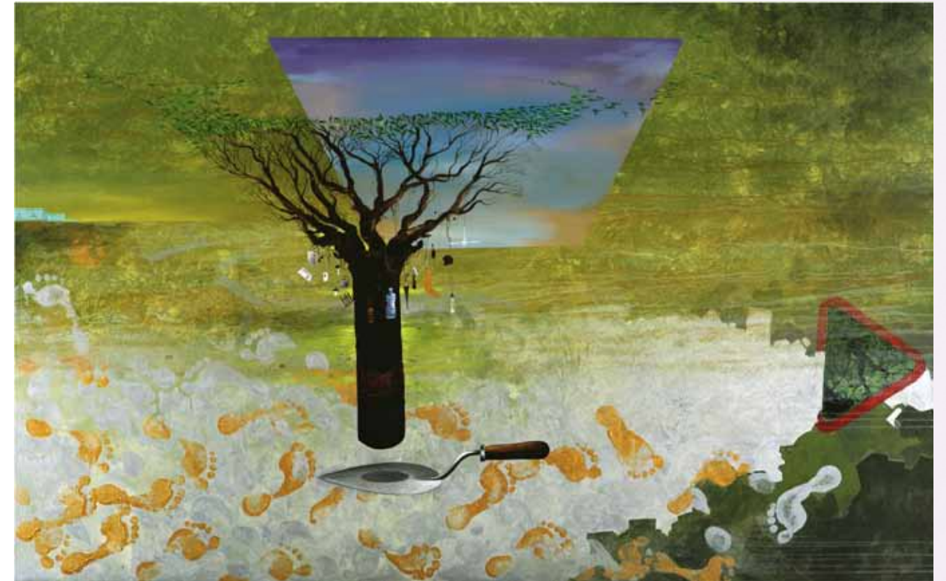
Acrylic on canvas, 2009, 60 x 96 in

1989: Diploma-Photography, College of Education and Technology, Bhubaneswar