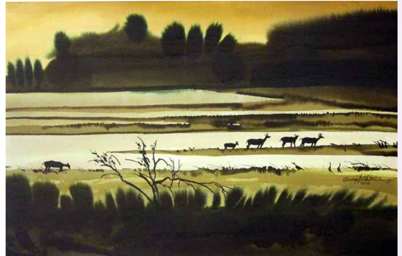
Watercolour on paper, 2012, 30 x 44 in

1982: Diploma (Fine Arts), Government College of Art & Craft, Kolkata