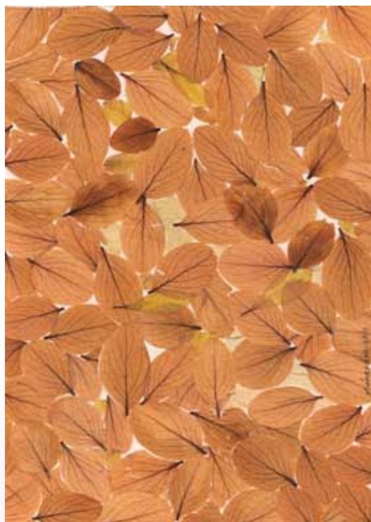
Dry flowers on paper, 2011, 7 x 5 in each