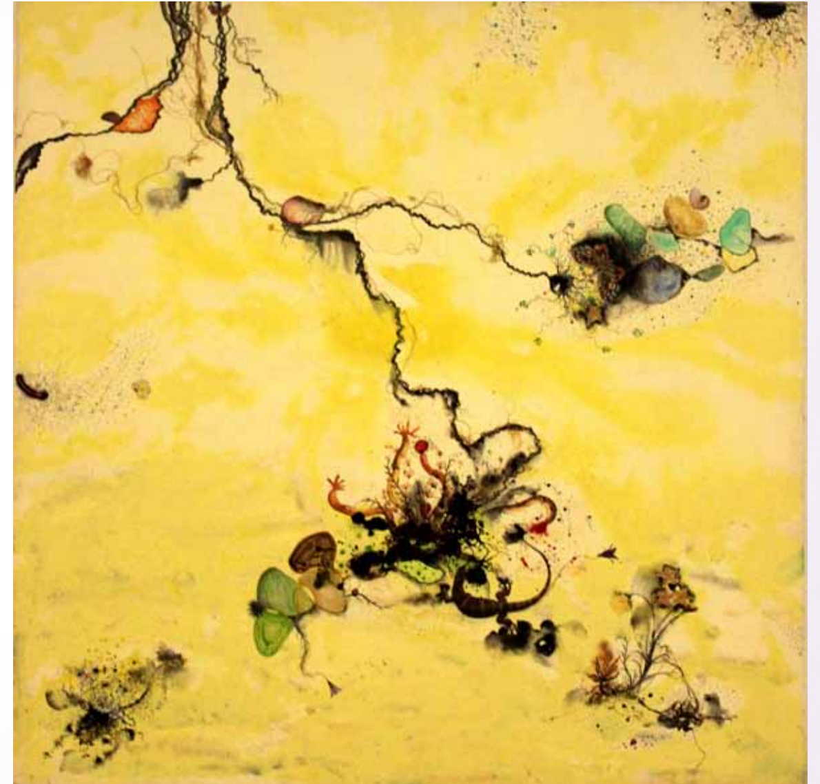
Mixed media on canvas, 2010 – 2012, 36 x 36 in

1995: B.F.A, Applied Arts, B. K. College of Art and Craft, Bhubaneswar