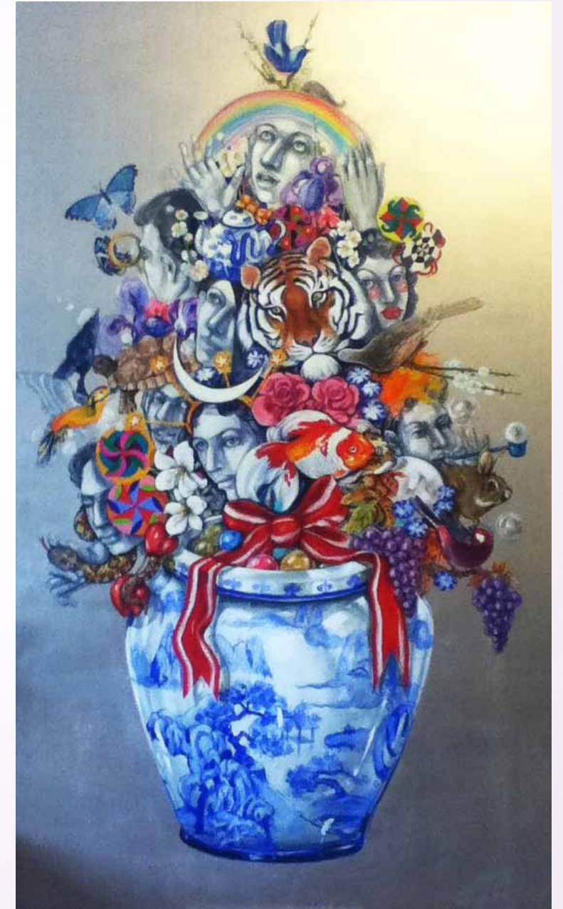
Acrylic on linen canvas, 2011, 60 x 36 in

1976: Bachelor of Science (Honours), Madhya Pradesh Horticulture University