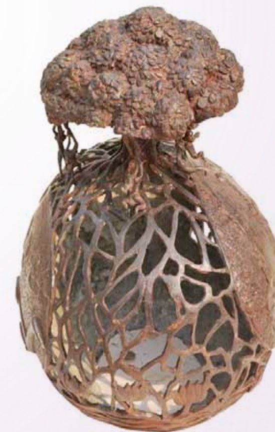
Bronze, 2011, 25 x 23 x 16 in