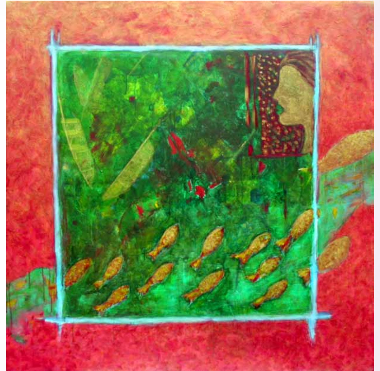
Acrylic on canvas, 2010, 48 x 48 in