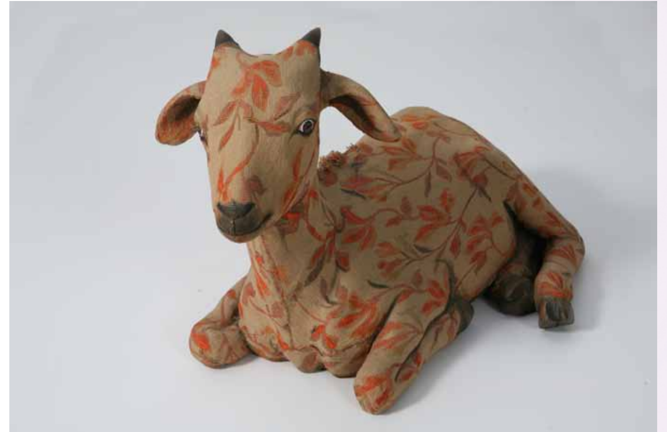
Fibreglass and painted fabric, 2006, 16.5 x 27 x 17 in