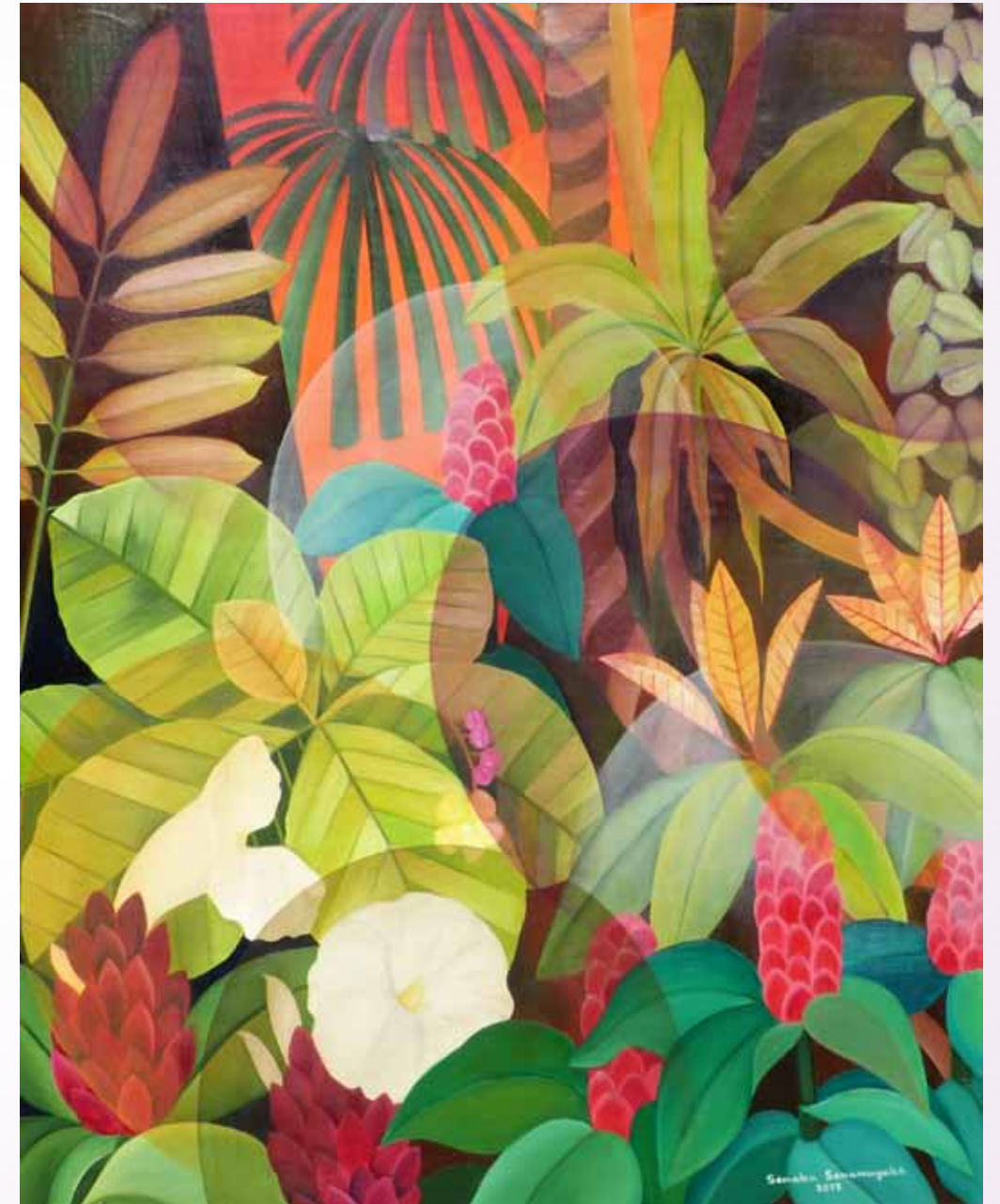
Oil on canvas, 2012, 60 x 48 in

1972: Degree in Art ( Major) and Architecture and Political Science, Yale University, CT, USA