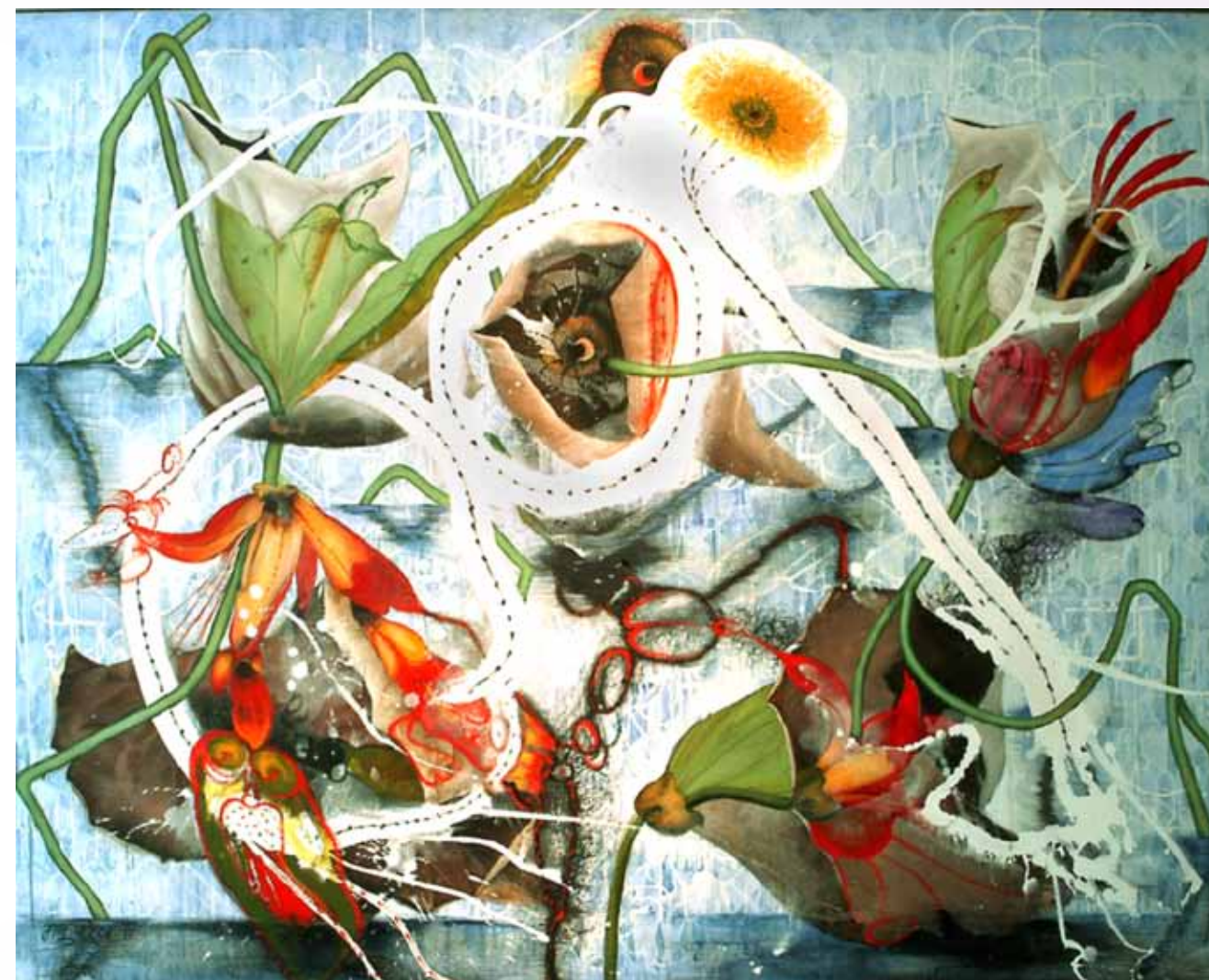
Acrylic on canvas, 2010, 48 x 60 in

1962: Diploma in Drawing & Painting, Sir J.J. School of Art, Mumbai