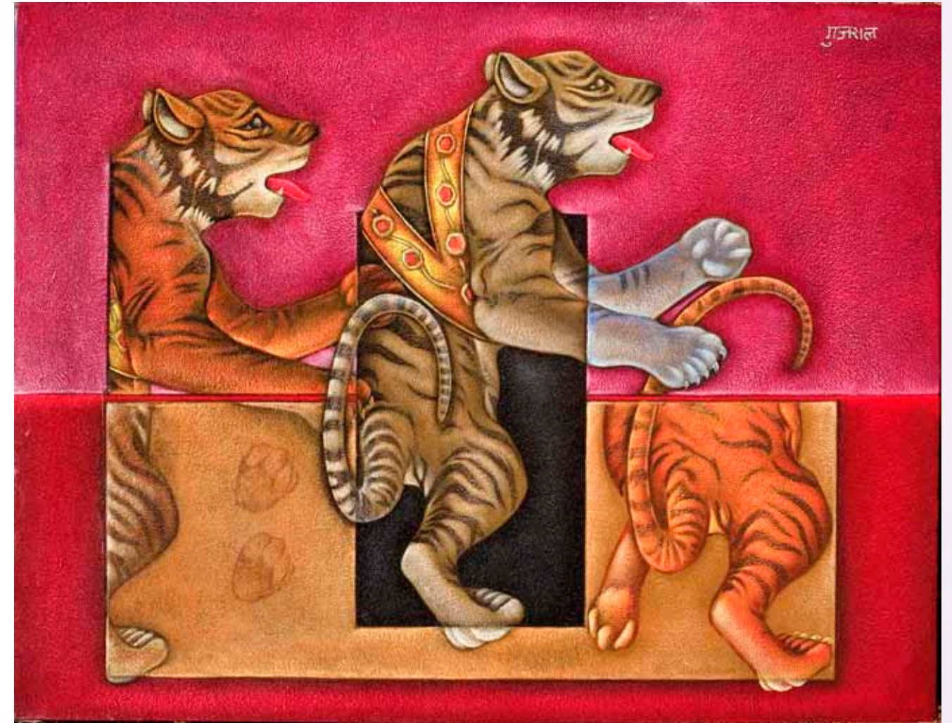
Acrylic on canvas, 2010, 42 x 54 in