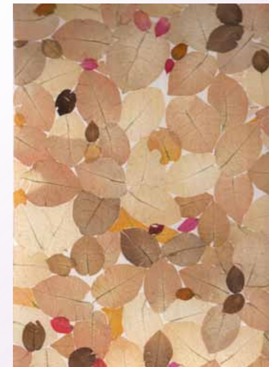
Dry flowers on paper, 2012, 10.5 x 7.5 in each