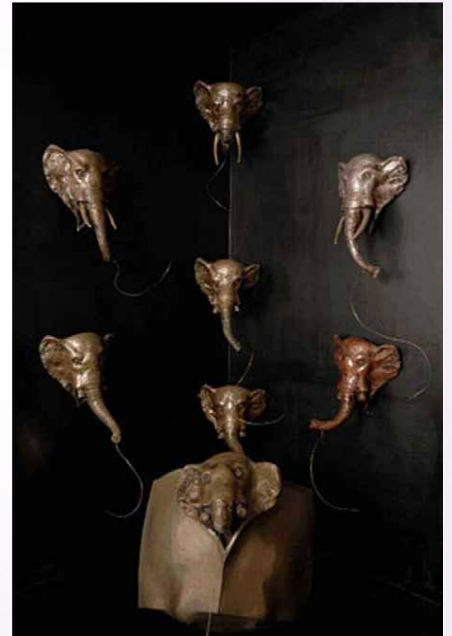
Fibreglass, 2008, Size variable

1980: Bachelor of Fine Arts (Sculpture), Faculty of Fine Arts, Maharaja Sayajirao University of Baroda