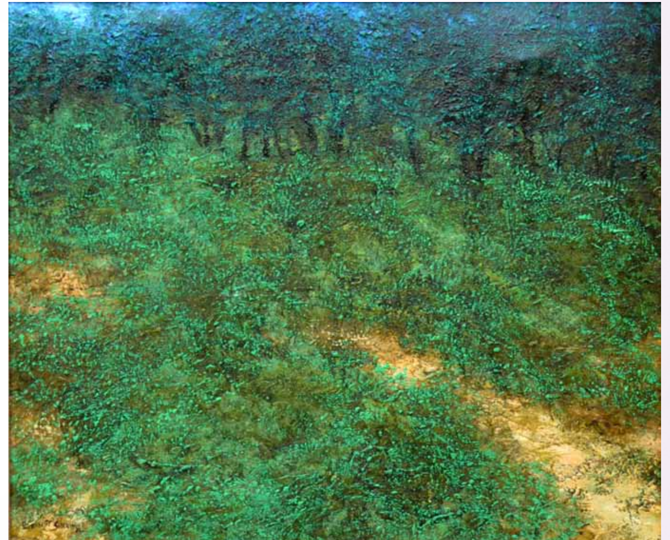
Oil on canvas, 2011, 30 x 36 in