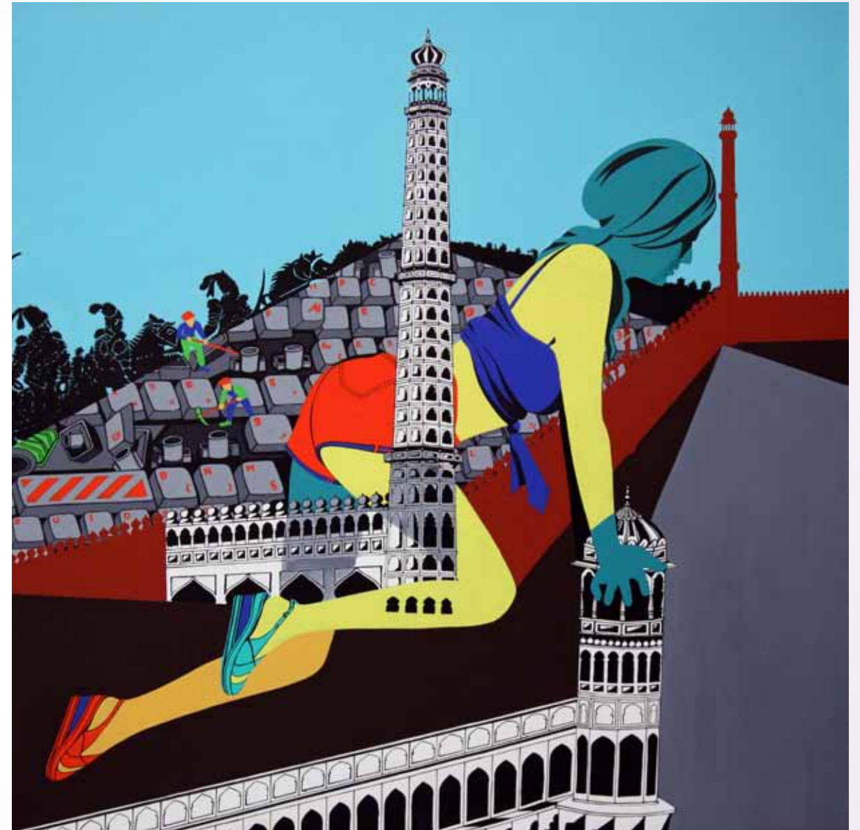
Acrylic on canvas, 2012, 36 x 36 in

1996: Bachelor of Fine Arts, Rajasthan School of Art, Jaipur