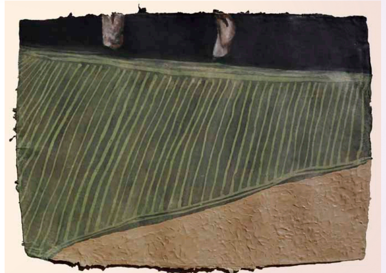
Mixed media on paper, 2011, 26.5 x 36.5 in

2008: Bachelor of Fine Arts, Faculty of Fine Arts, Maharaja Sayajirao University, Baroda