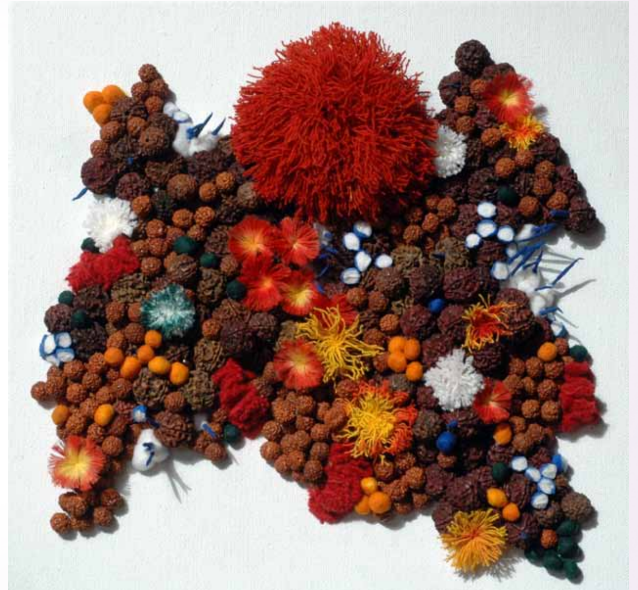
Materials of Hindu rituals on canvas (rudraksha beads, mauli sacred thread, janyu brahminisation thread, cotton lamp wicks), 2012, 12 x 12 in

1995: Bachelor of Fine Arts, Faculty of Fine Arts, Maharaja Sayajirao University, Baroda