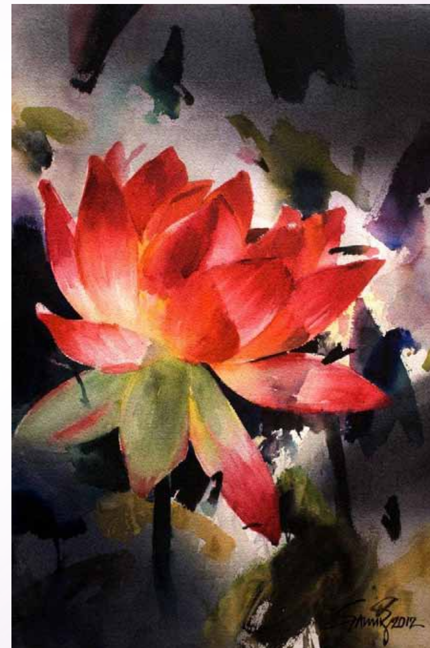
Watercolour on 300 gsm arches paper, 2012, 22 x 15 in

1975: Government College of Arts, Kolkata