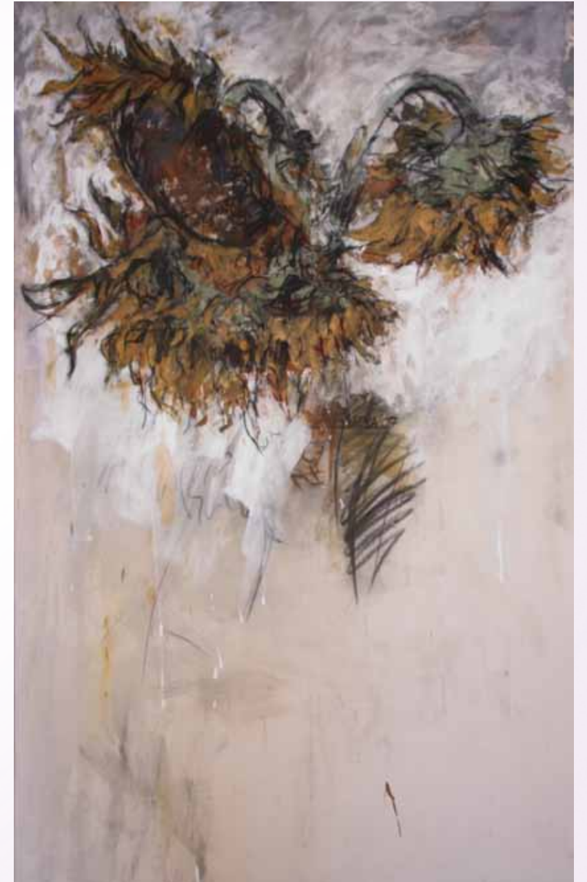
Mixed media on canvas, 2006, 90 x 56 in

1996: Graduate in Architecture, School of Planning & Architecture, New Delhi