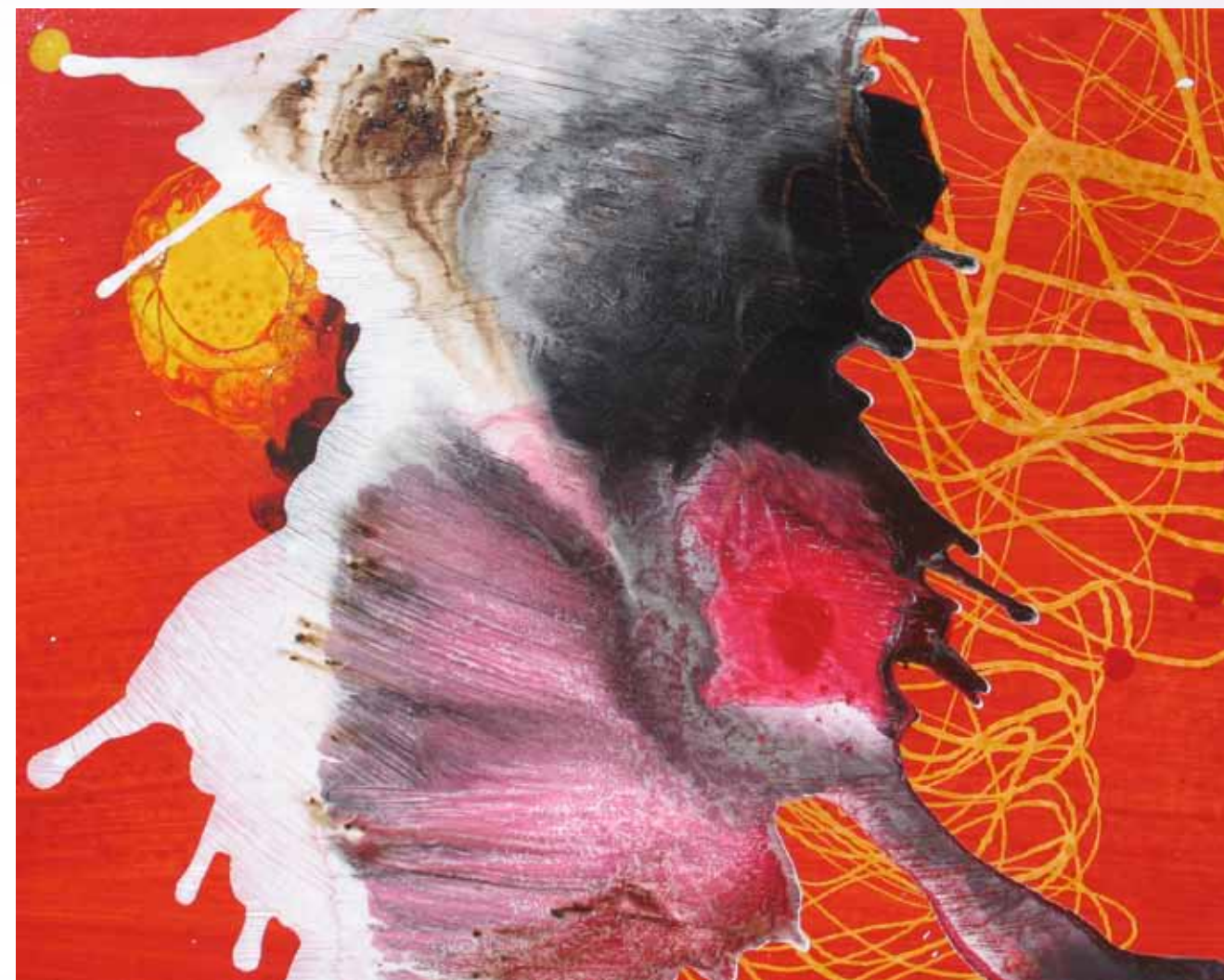
Mixed media on canvas, 2012, 15" X 19"