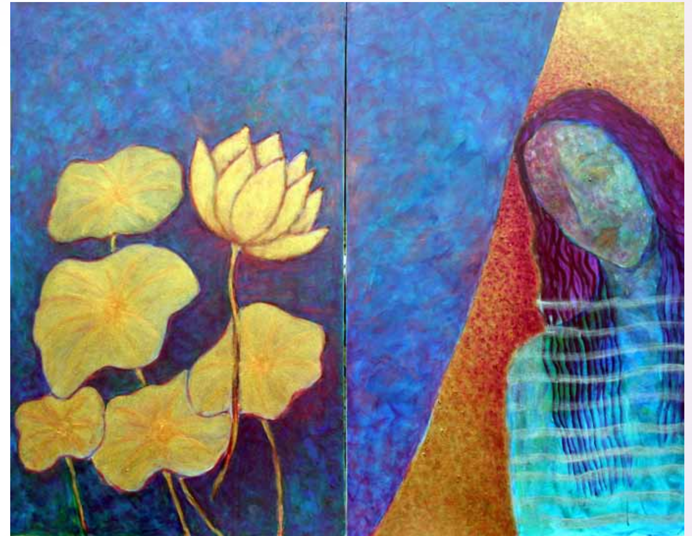
Acrylic on canvas, 2010, 48 x 60 in