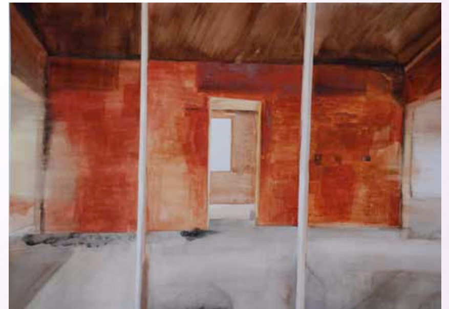
B) Mixed media on paper, 2008, 22 x 28 in