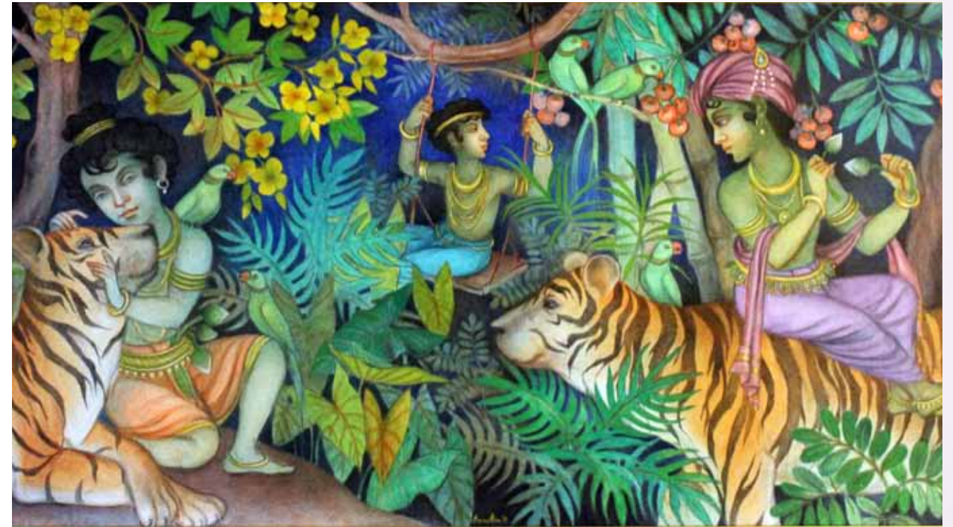
Tempera on canvas, 2011, 36 x 72 in

1993: Bachelor of Arts, Visva-Bharati University, Santiniketan