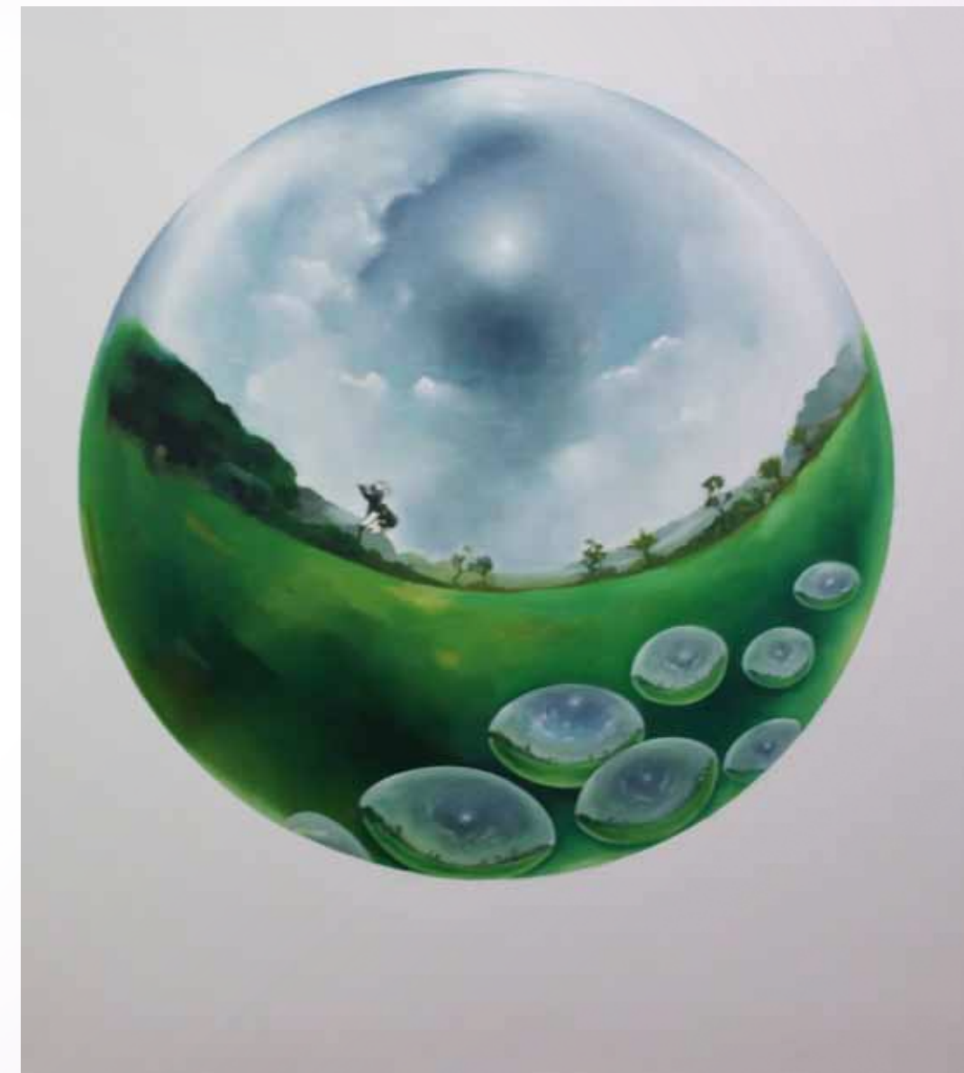
Oil on canvas, 2011, 60 x 66 in

2002: Bachelor of Fine Art, B.K. College of Arts and Crafts