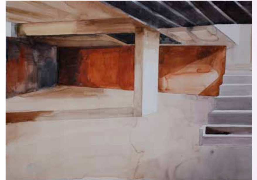
A) Mixed media on paper, 2008, 22 x 28 in

2002: Bachelor of Fine Arts, Faculty of Fine Arts, Maharaja Sayajirao University, Baroda