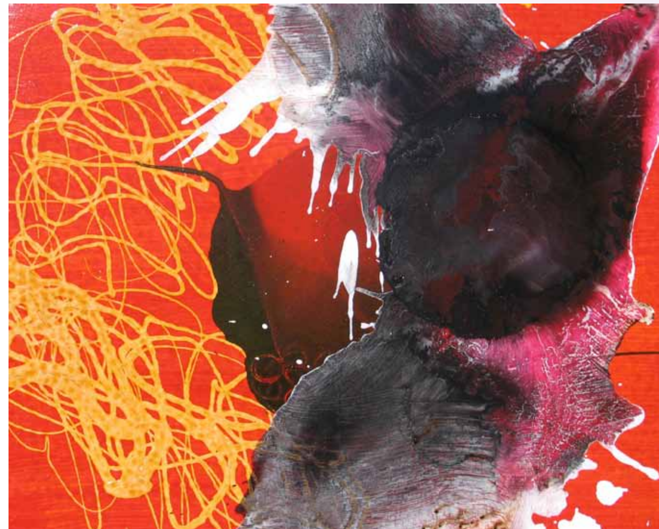
Mixed media on canvas, 2012, 15" X 19"