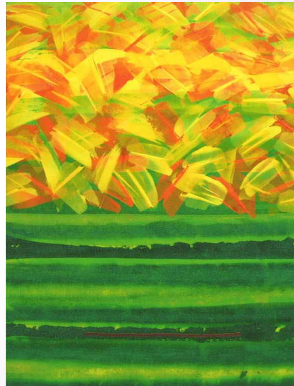
Acrylic on canvas, 2007, 36 x 28 in

2003: Master of Fine Arts (Painting), Government Institute of Fine Arts, Indore