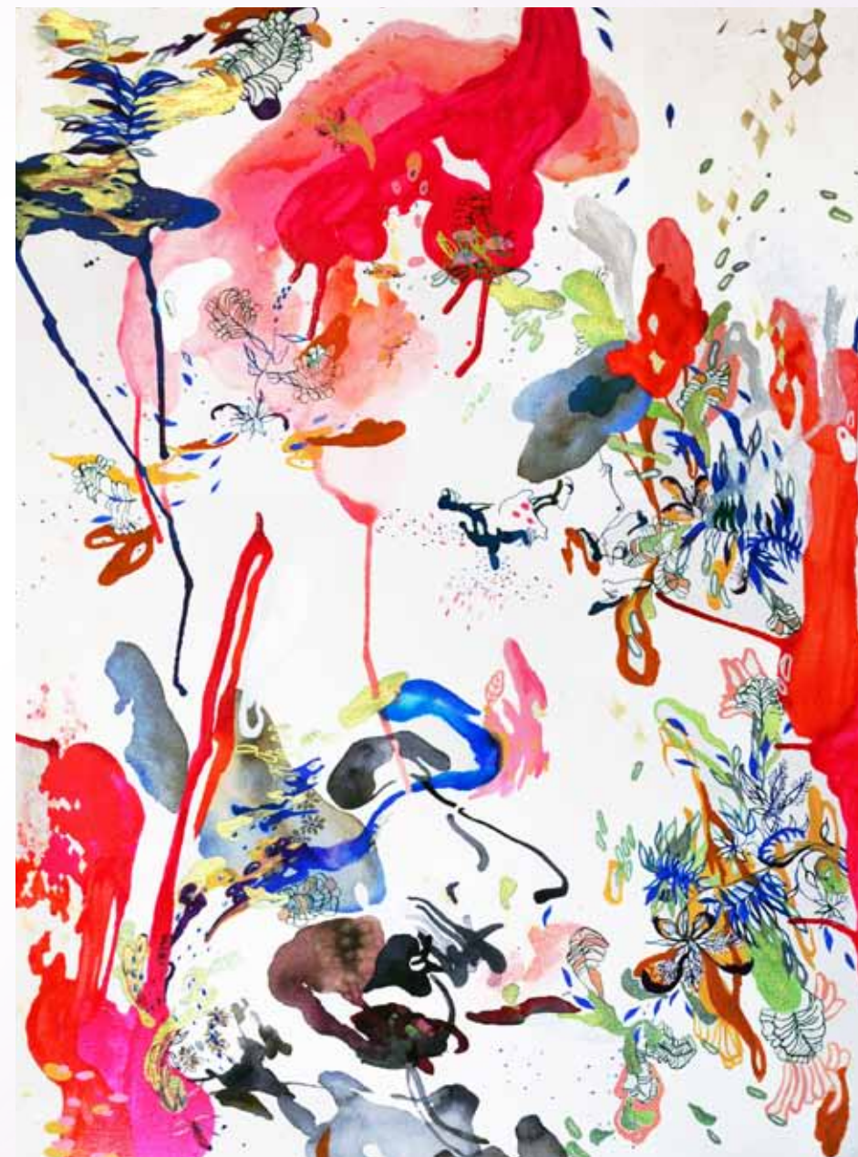
Acrylic, ink, watercolour and pencil on paper, 2011, 30 x 22 in

2001: B.F.A. (painting and drawing), Art History, Maharaja Sayajirao University, Baroda