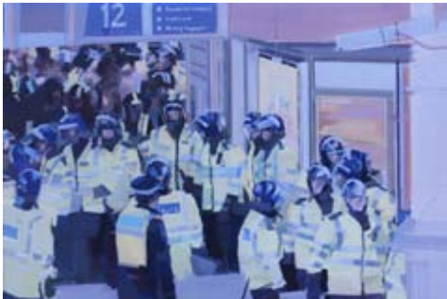
Event 18cm x 27cm Acrylic on Canvas 2011