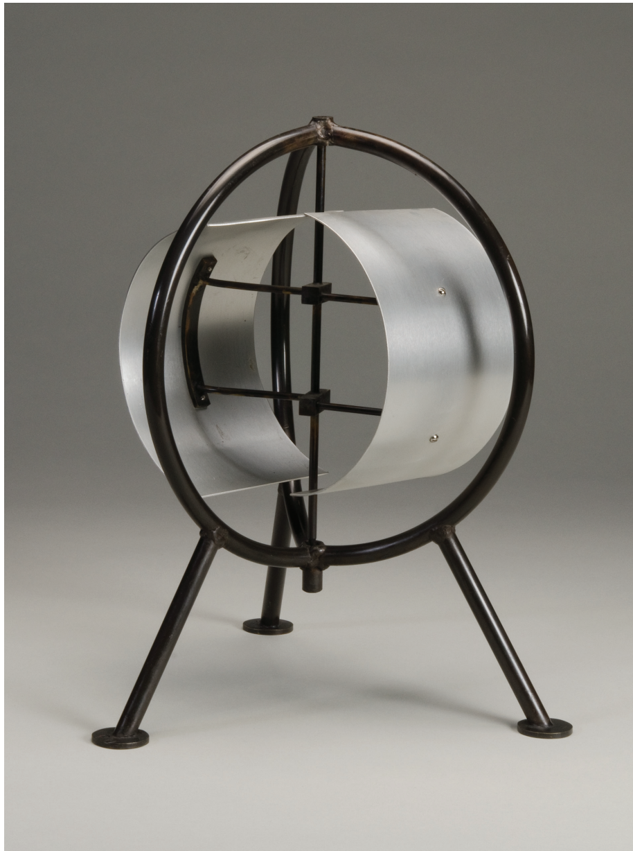
STEROPE , 2008, BRASS AND ALUMINUM, 13 × 11 × 11 INCHES