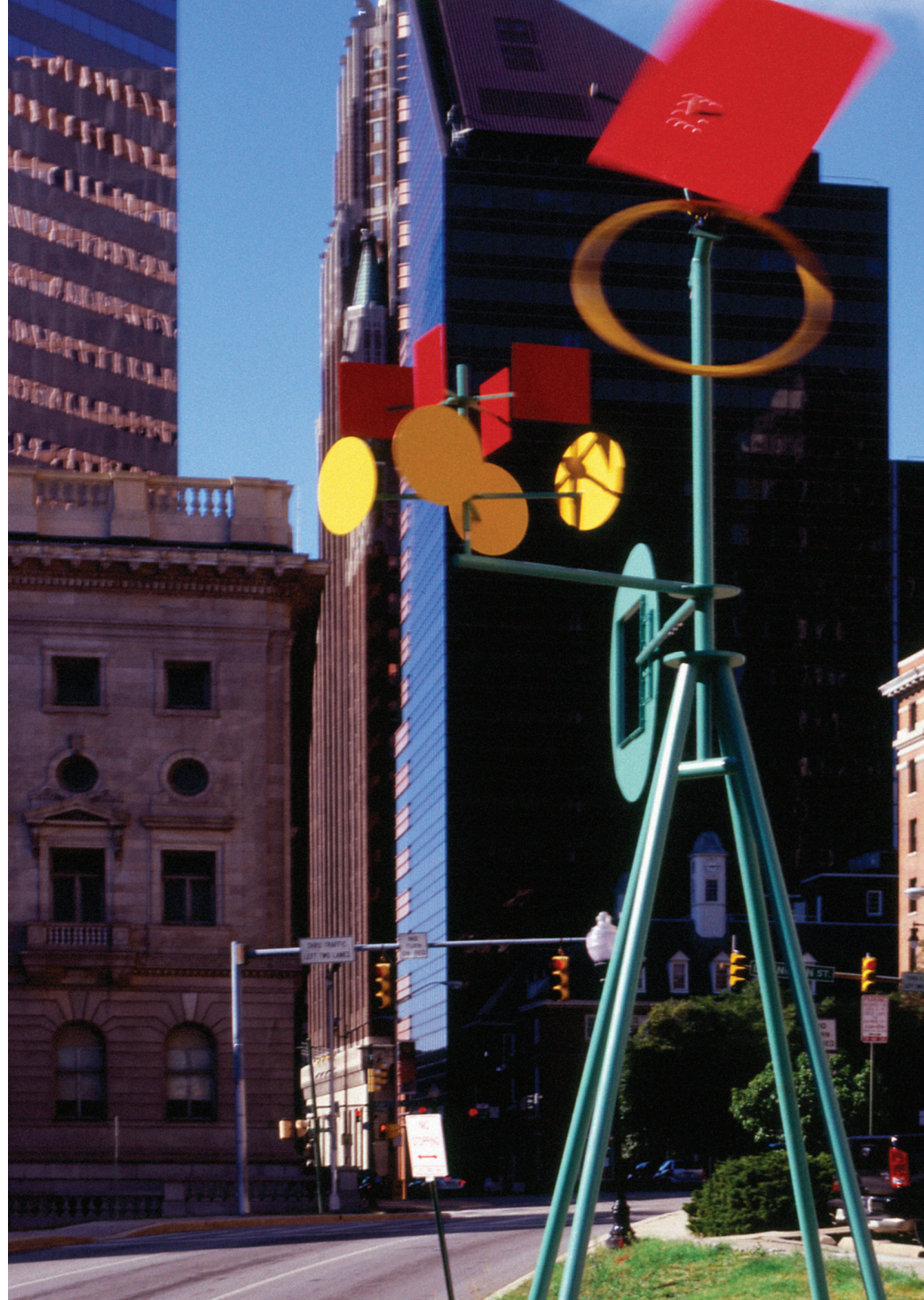
KIKO-GY , 2007, ALUMINUM AND STEEL, 24 × 20 × 20 FEET (Right)