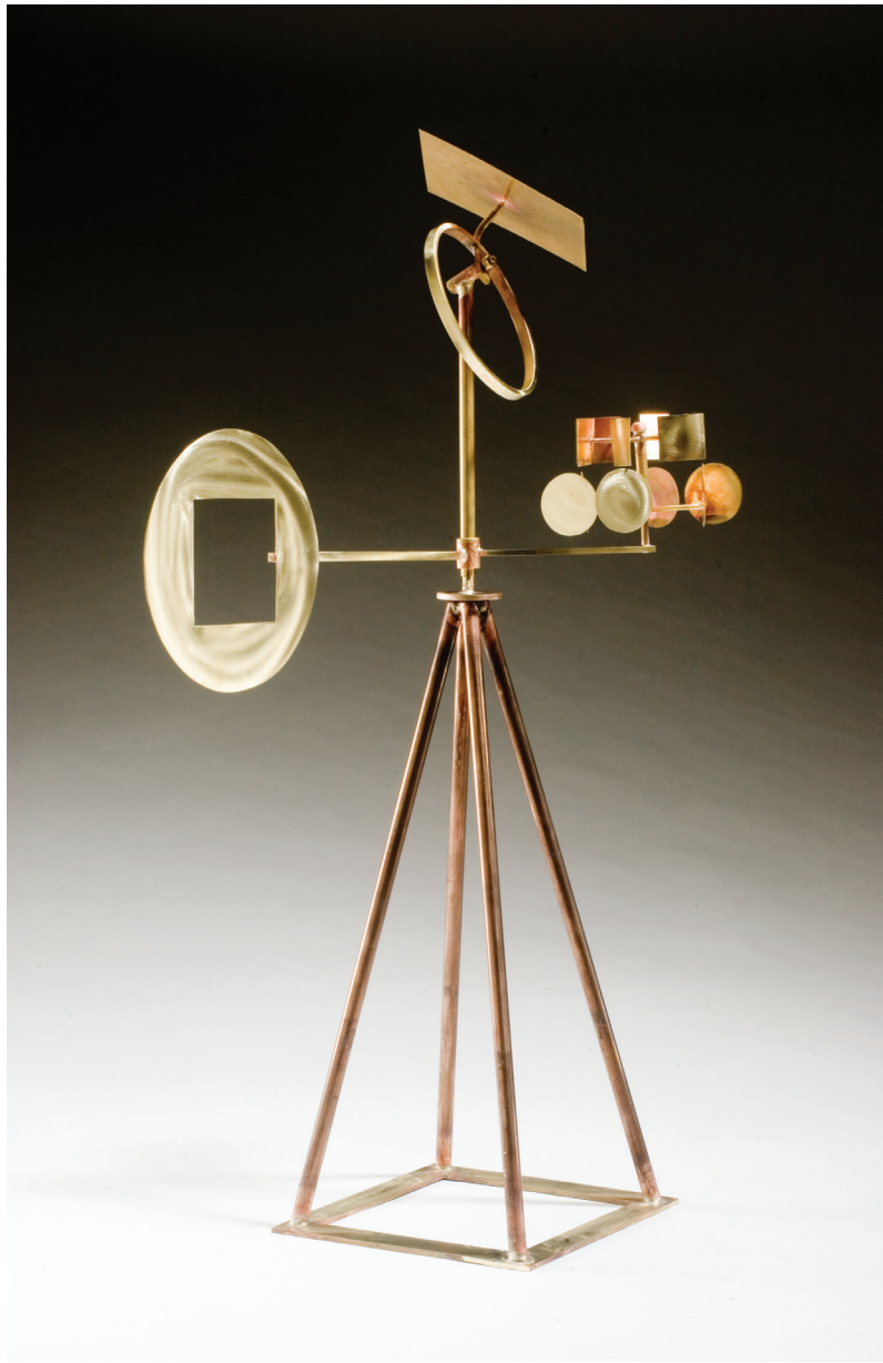
KIKO III , 2007, BRASS, 23 × 15.25 × 6.5 INCHES