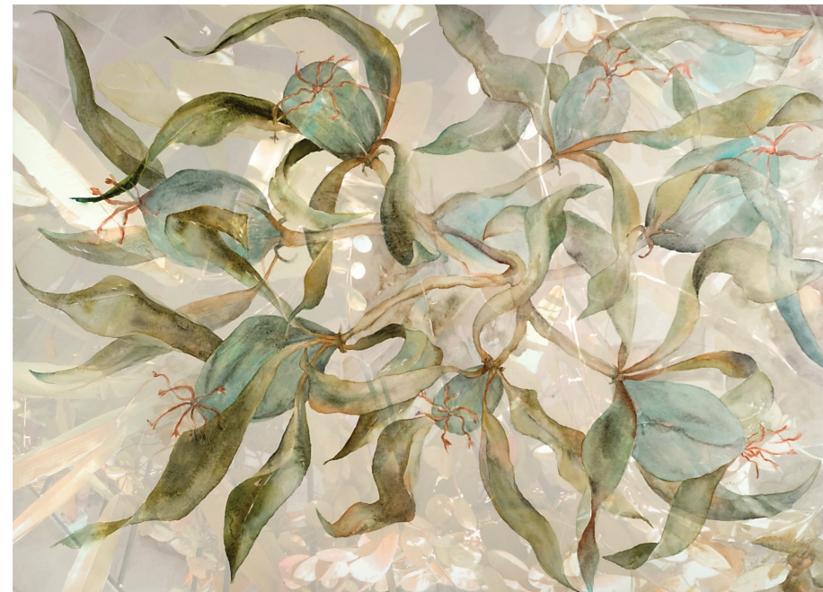
PAPAYA NUEVO , 2011, WATERCOLOR & ARCHIVAL INK JET ON PAPER, 47 × 32 INCHES

For the artist visually re-presenting the natural world through her art is a means of