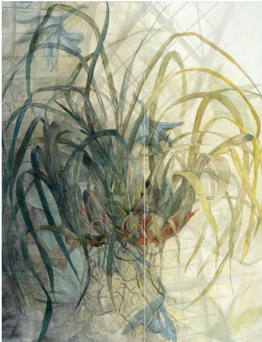
ORPHEUS' ORCHID , 2011, WATERCOLOR & ARCHIVAL INK JET ON PAPER, 47 × 36 INCHES (Two panels)