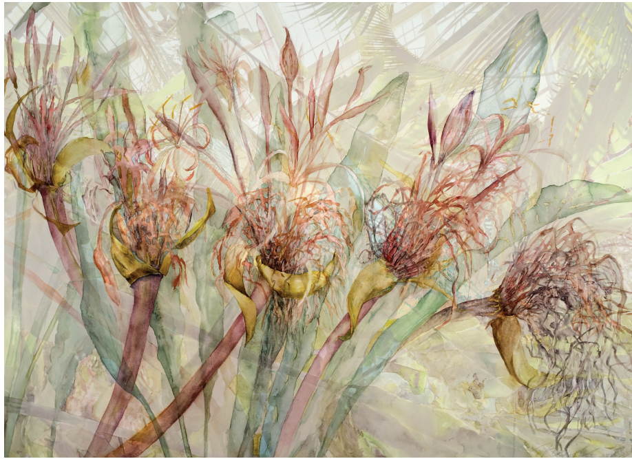
TOXIC BEAUTY, QUEEN EMMA , 2011, WATERCOLOR & ARCHIVAL INK JET ON PAPER, 35 × 47 INCHES