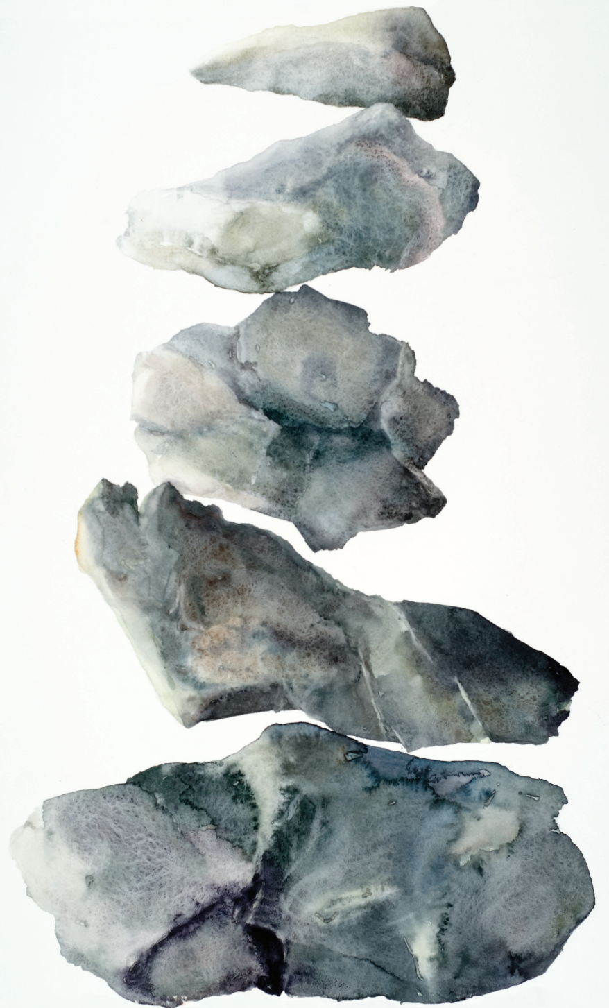
BALANCE OF HERMA , 2011, WATERCOLOR ON PAPER, 30 × 22 INCHES (Right)