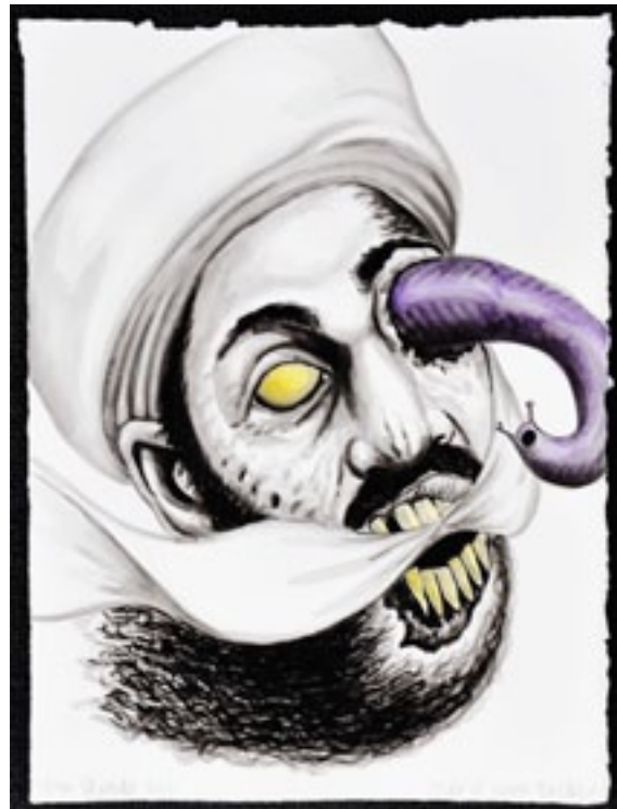
"STUDY OF OSAMA BIN LADEN"/INK ON PAPER/35.5X28 CM/2011