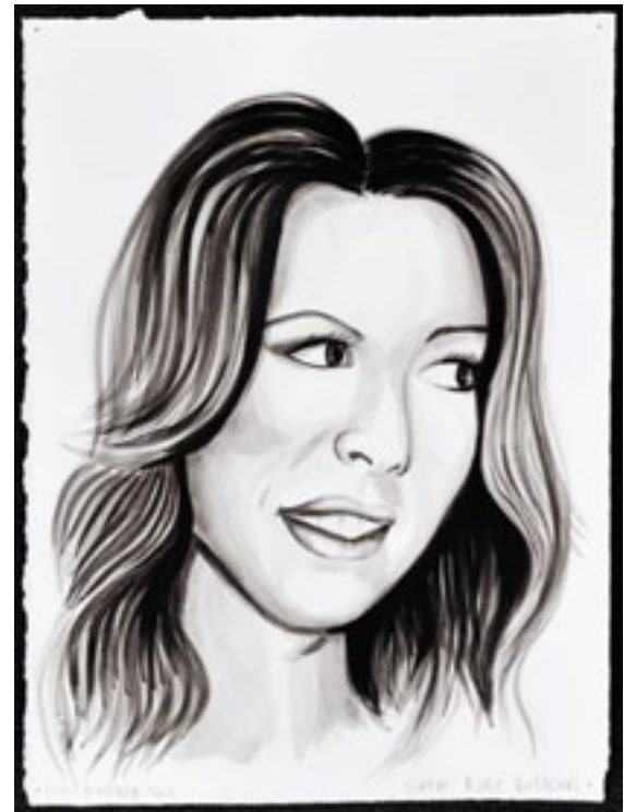
"STUDY OF RUBY RUBACUORI"/INK ON PAPER/35.5X28 CM/2011