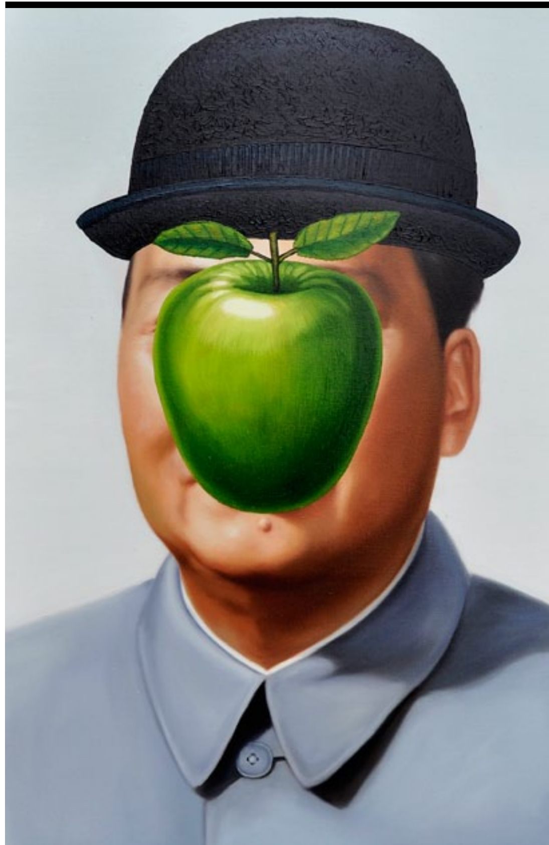
"CUSTOM MAO ZEDONG (MAGRITTE)"/OIL ON CANVAS/91.5X61 CM/2011