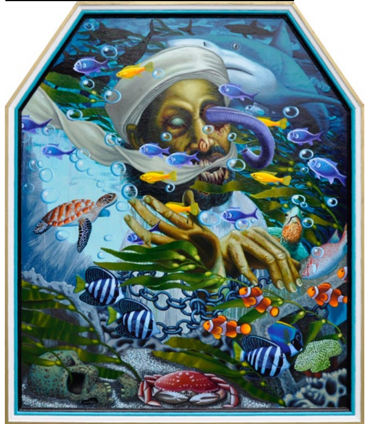
“WATERY GRAVE (OSAMA BIN LADEN)“/OIL ON CANVAS/122X101.5 CM/2011

TOM SANFORD / SEPTEMBER 2011 / PAGE 16/17