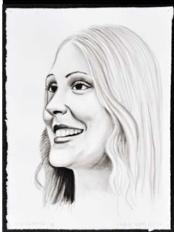
"STUDY OF NOEMI LETIZIA"/INK ON PAPER/35.5X28 CM/2011