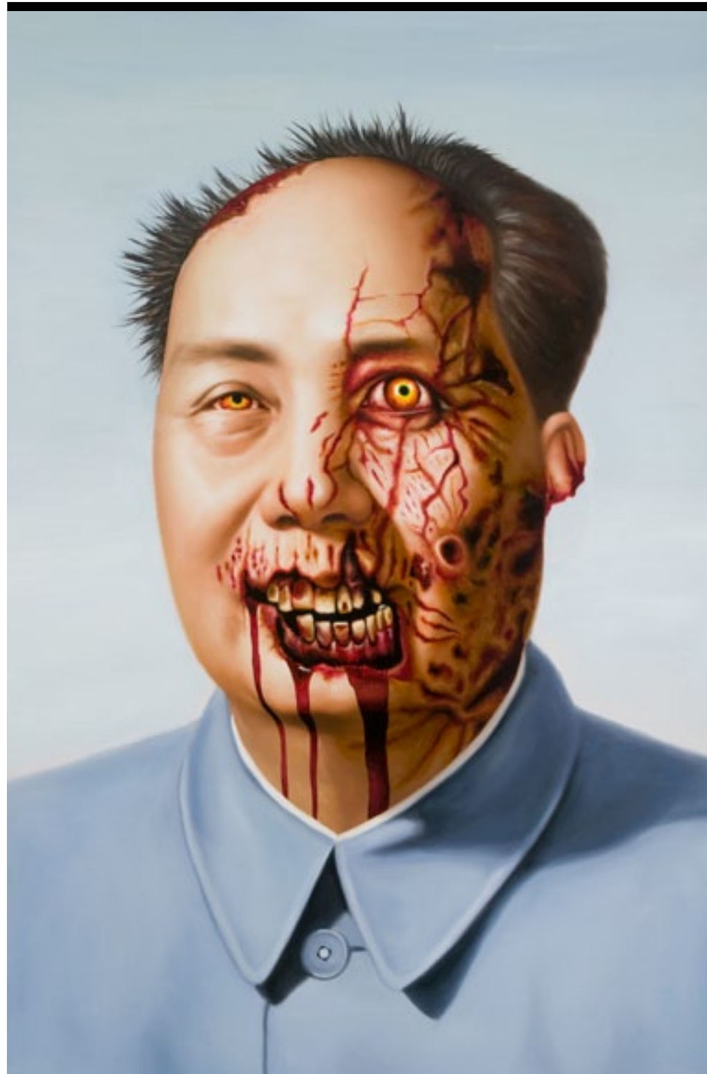
"CUSTOM MAO ZEDONG (ZOMBIE)"/OIL ON CANVAS/91.5X61 CM/2011

"I WISH I HAD TIME TO PAINT MORE THINGS, BUT ART IS SLOW AND THE WORLD IS FAST"