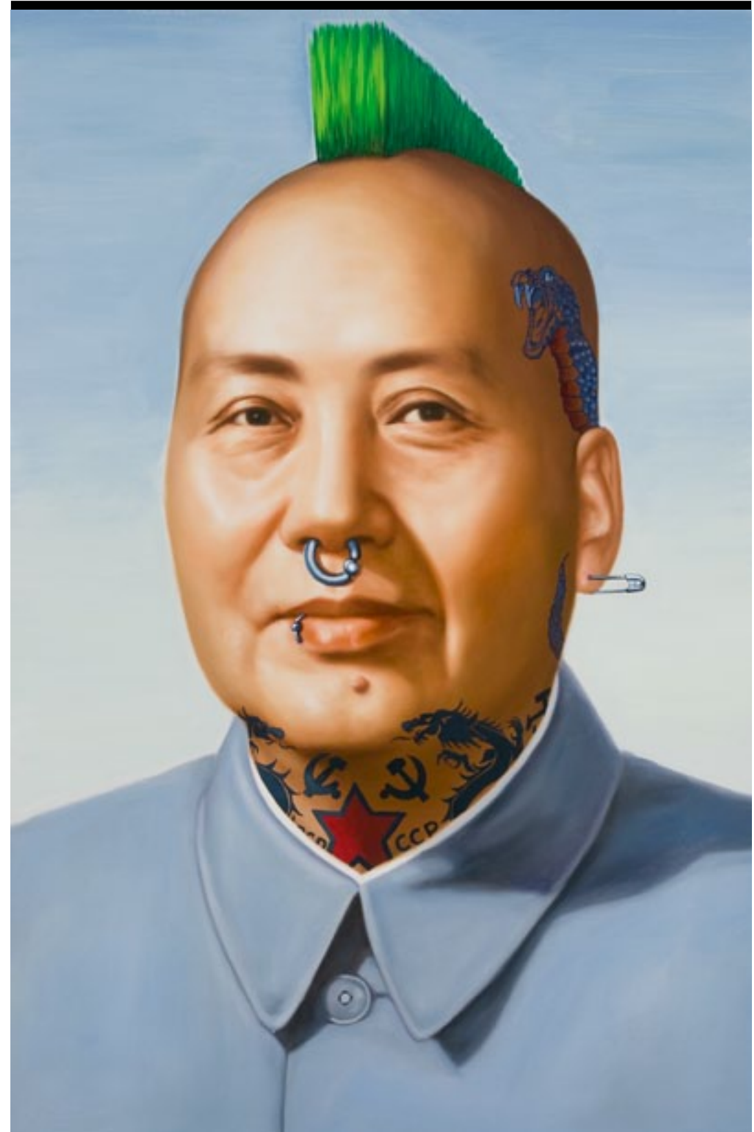
"CUSTOM MAO ZEDONG (PUNK)"/OIL ON CANVAS/91.5X61 CM/2011