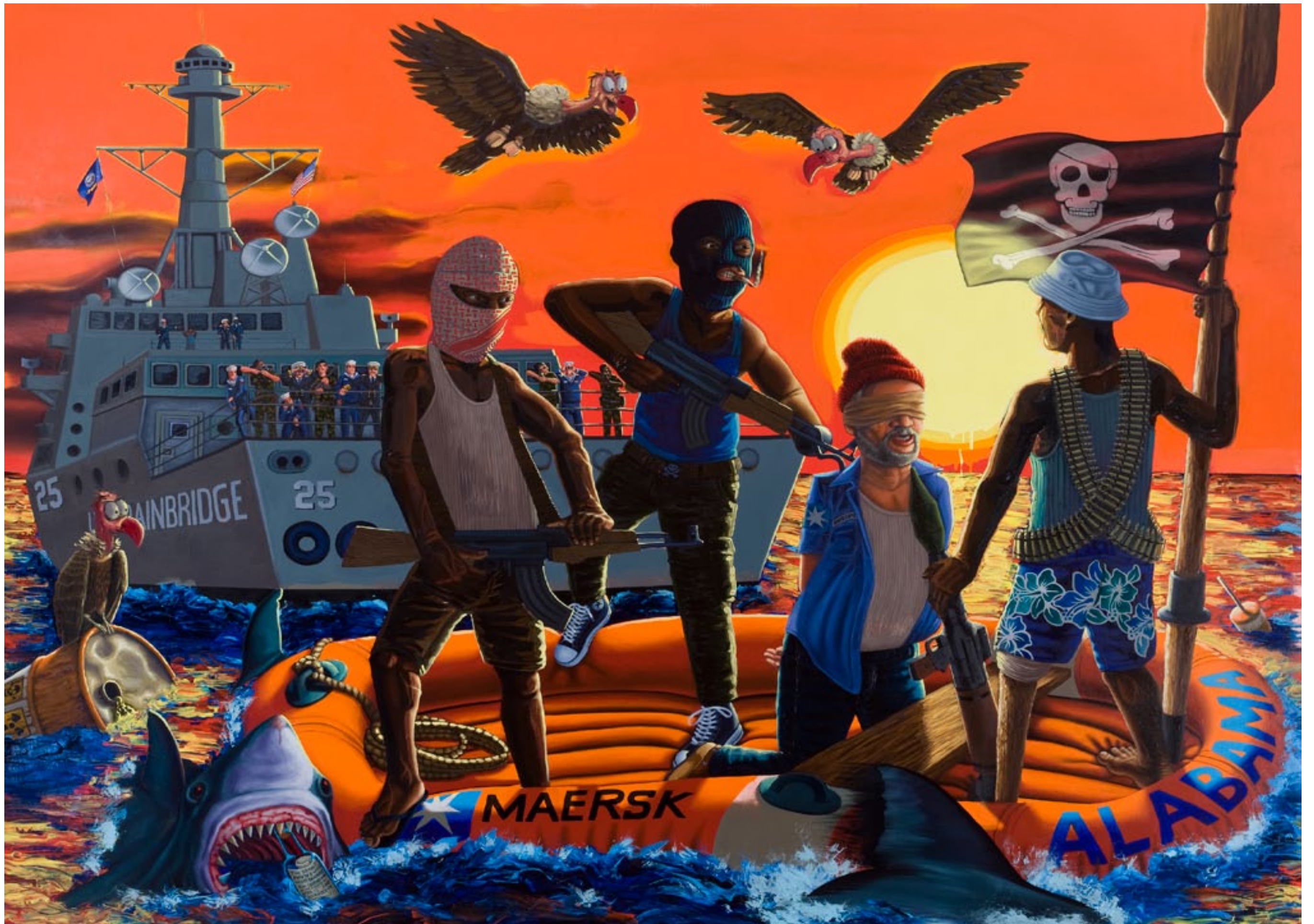
"THE SOMALI PIRATES VERSE THE USS BAINBRIDGE" / OIL ON CANVAS / 213 X 264CM / 2011