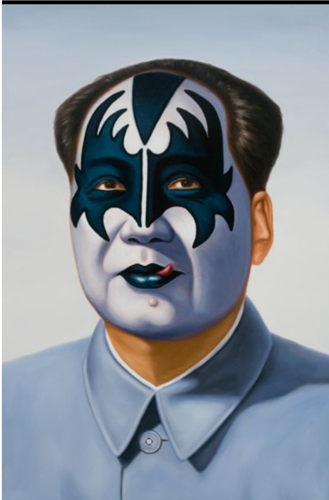
"CUSTOM MAO ZEDONG (KISS - GENE SIMMONS)"/OIL ON CANVAS/91.5X61 CM/2011