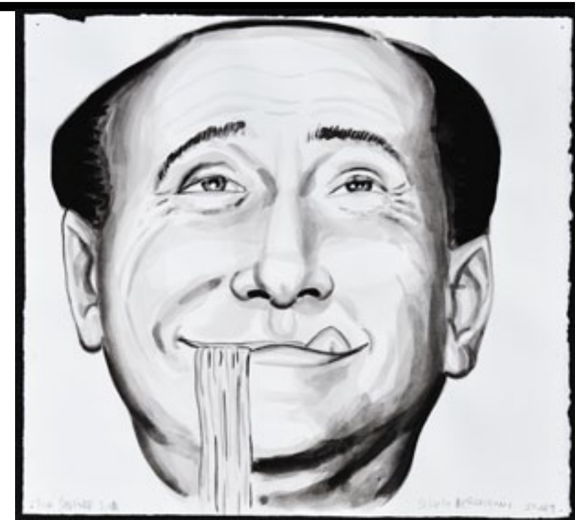
"STUDY OF SILVIO BERLUSCONI"/INK ON PAPER/35.5X40.5 CM/2011