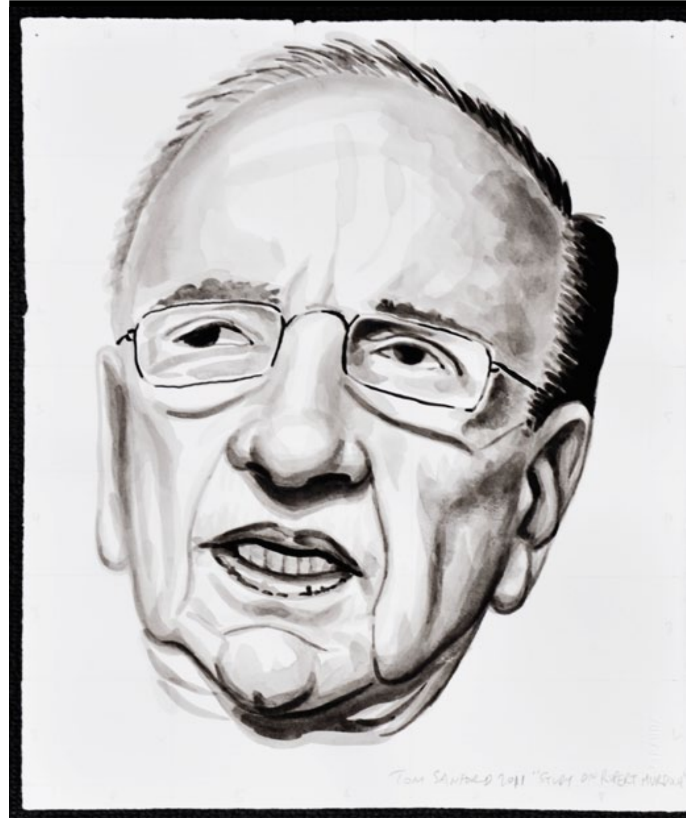
"STUDY OF RUPERT MURDOCK"/INK ON PAPER/35.5X28 CM/2011