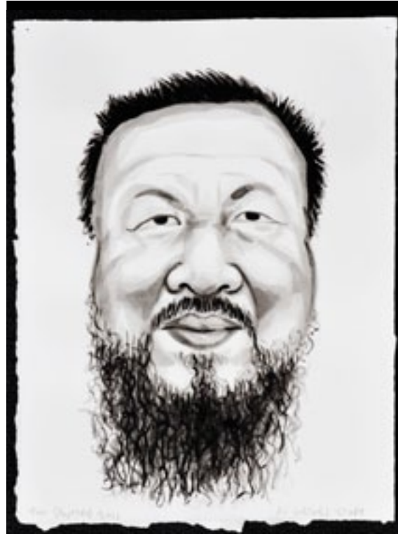
"STUDY OF AI WEIWEI"/INK ON PAPER/35.5X28 CM/2011