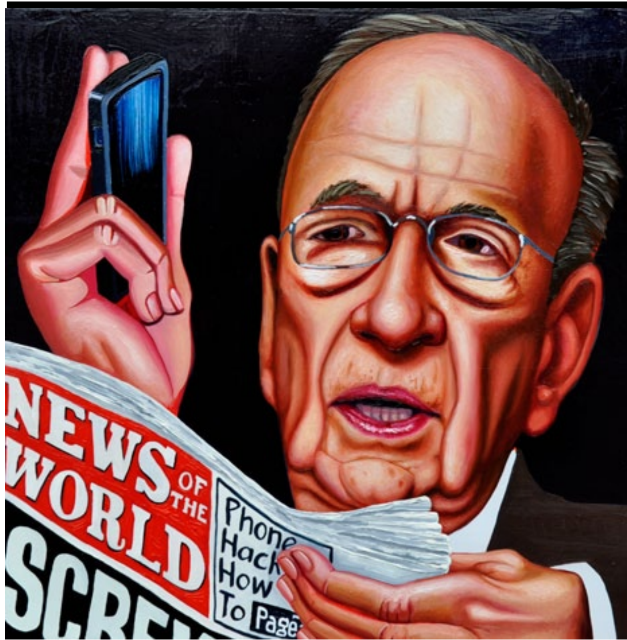
"NEWS OF THE WORLD (RUPERT MURDOCH)"/OIL ON WOOD/40.5X40.5 CM/2011