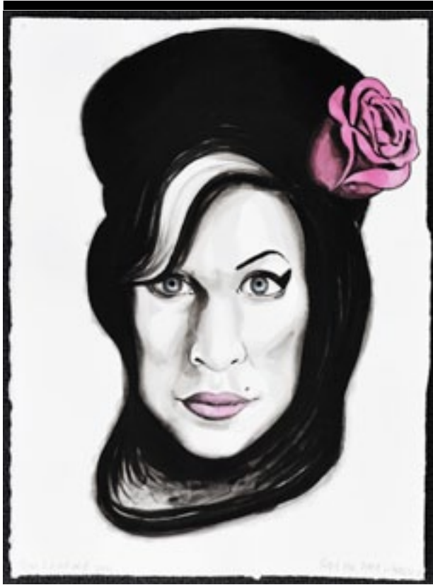
"STUDY OF AMY WINEHOUSE"/INK ON PAPER/35.5X28 CM/2011