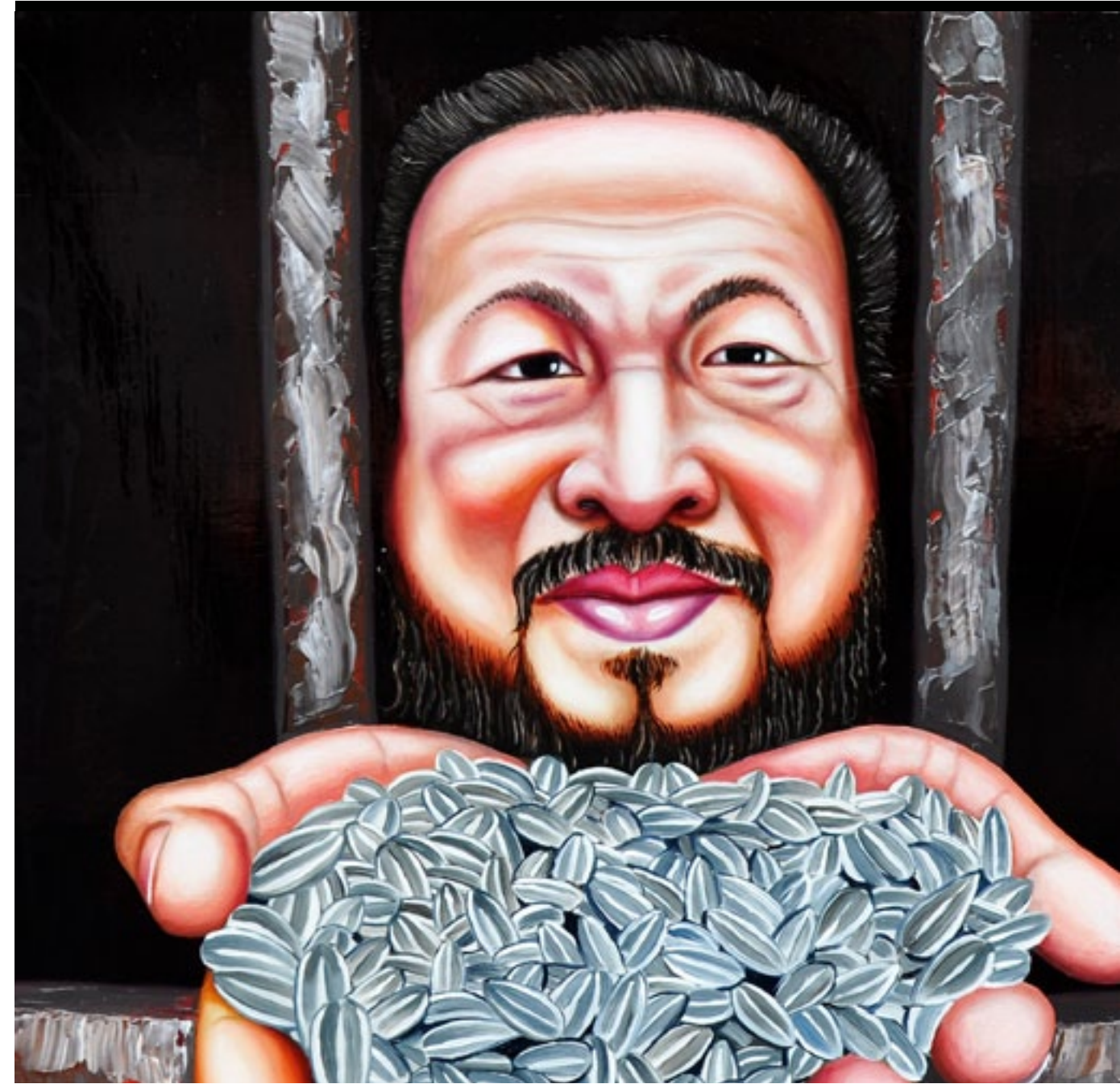
"CHINESE PRISON (AI WEIWEI)"/OIL ON WOOD/45.5X45.5 CM/2011