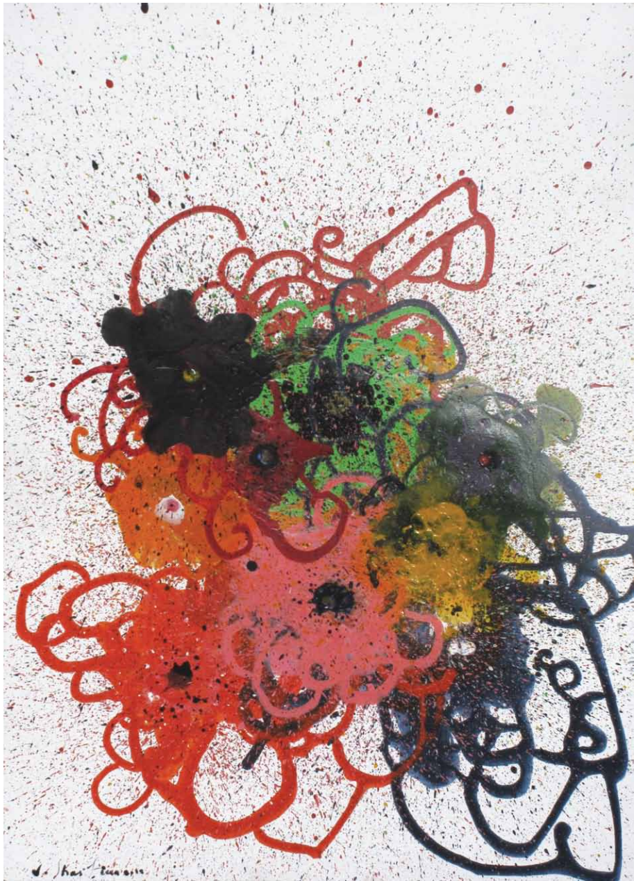
Vahid Sharifian / from "Flowers" series / acrylic on paper / 70x50 cm / 2012