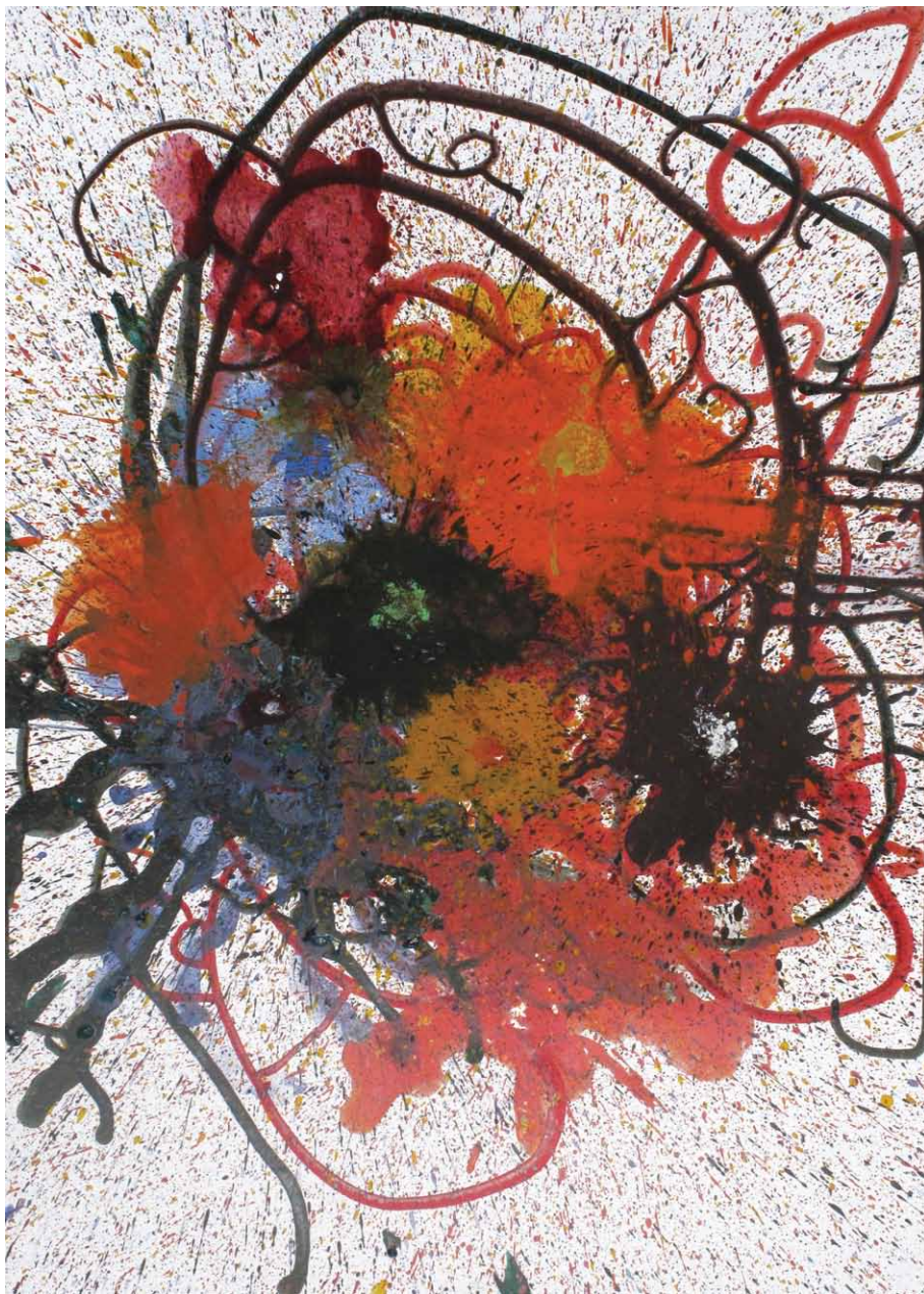
Vahid Sharifian / from "Flowers" series / acrylic on paper / 70x50 cm / 2012