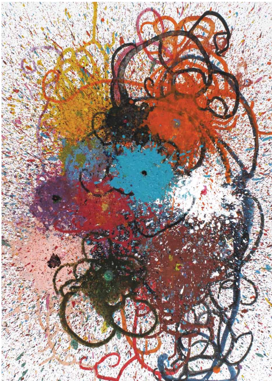
Vahid Sharifian / from "Flowers" series / acrylic on paper / 70x50 cm / 2012