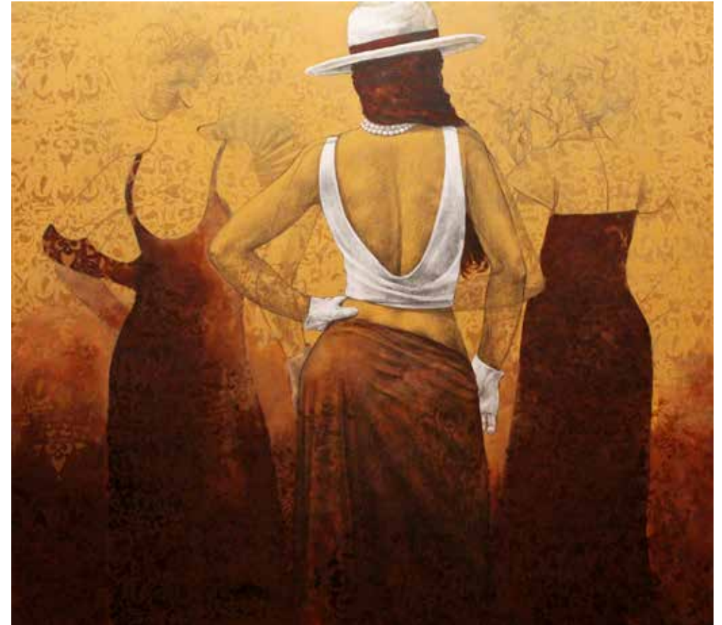
NOBODY LIKE ME Pencil & Acrylic on canvas 130 x 150 cm , 2013