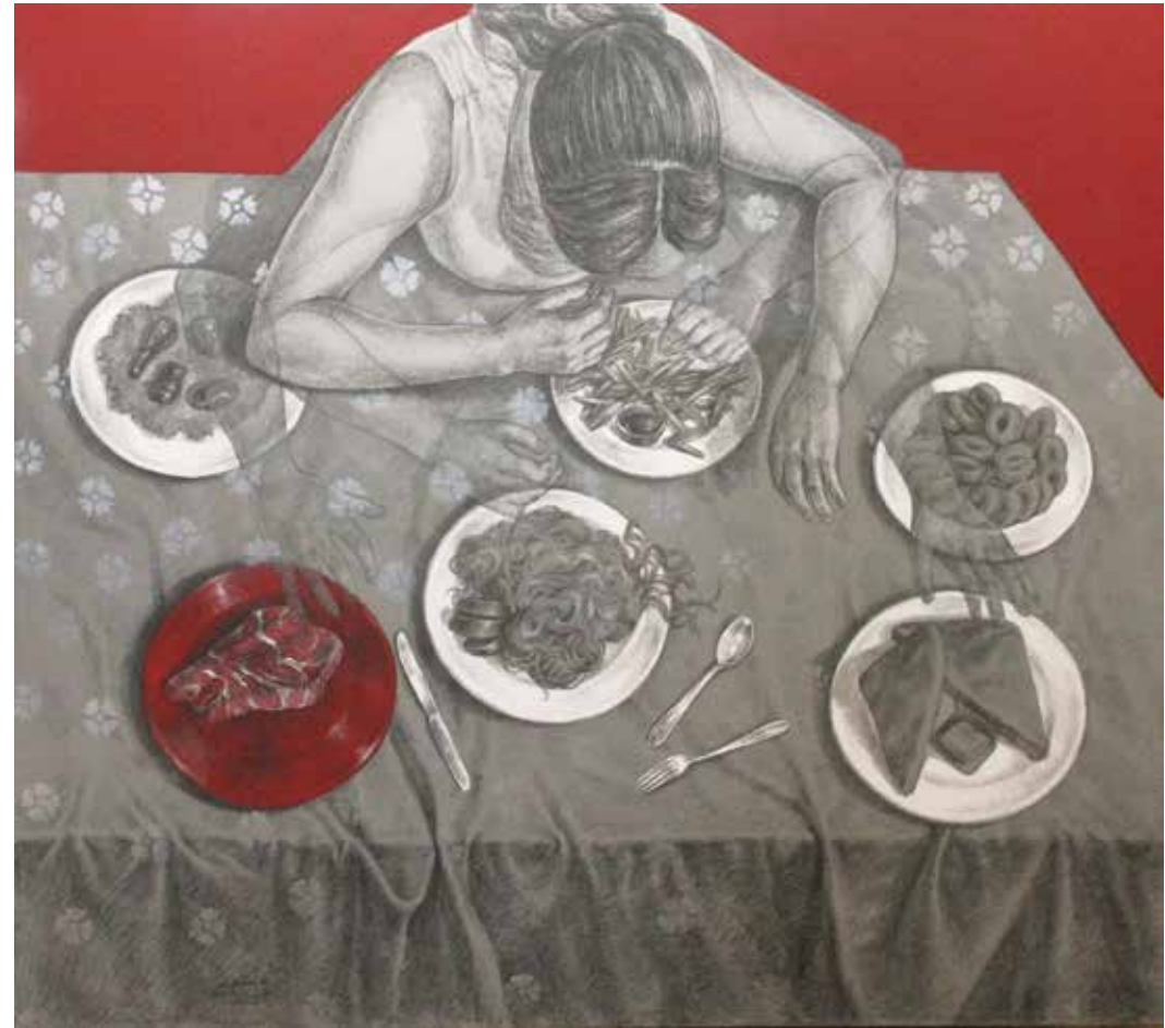
GLUTTONY 1 | Pencil & Acrylic on canvas 130 x 150 cm , 2013