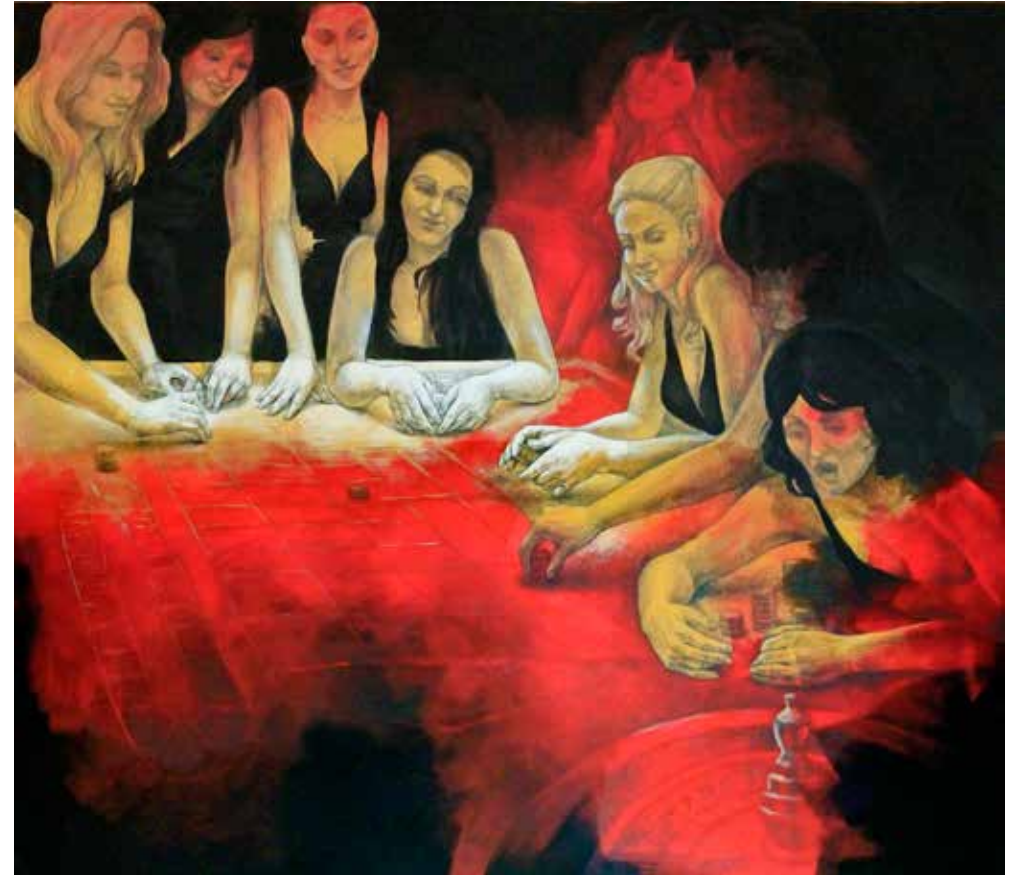
GREED OF POKER Pencil & Acrylic on canvas 130 x 150 cm , 2013