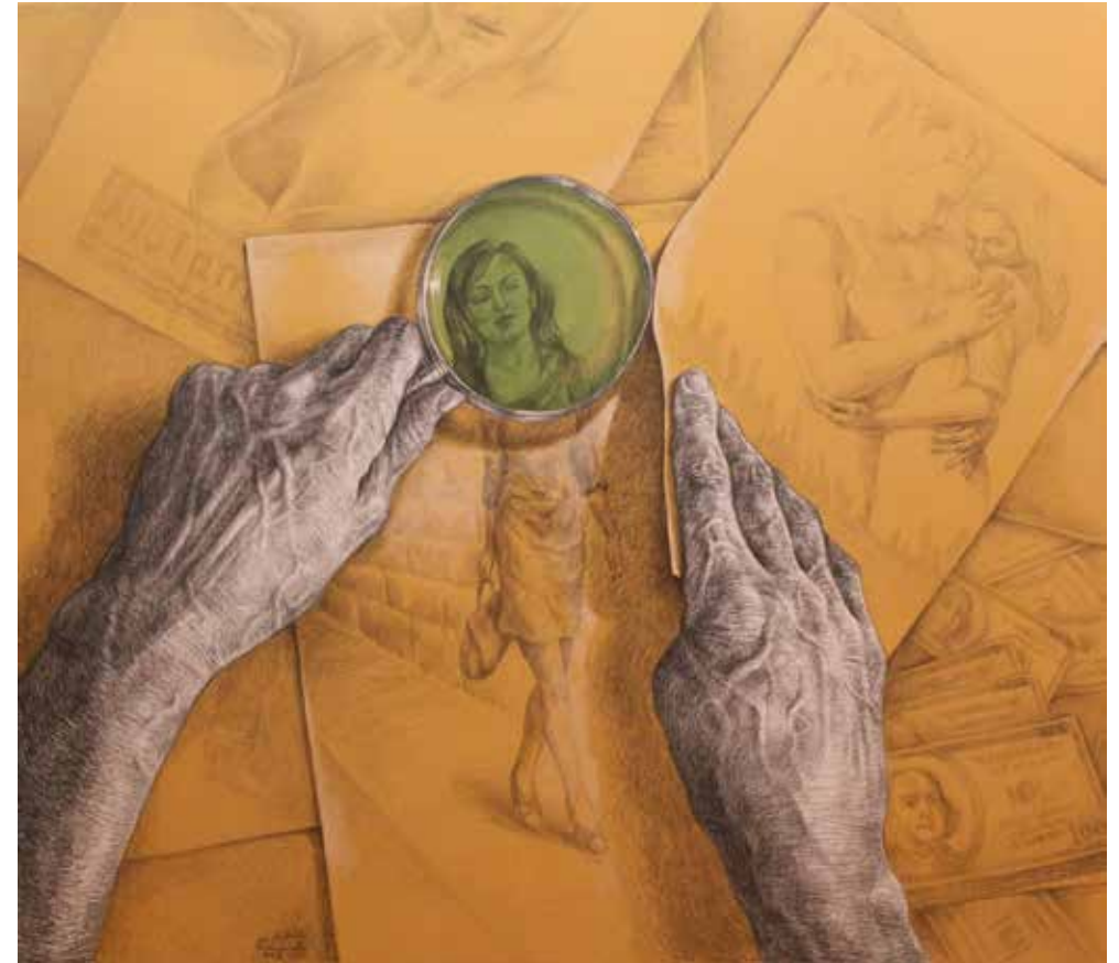
I WISH TO BE Pencil & Acrylic on canvas 130 x 150 cm , 2013