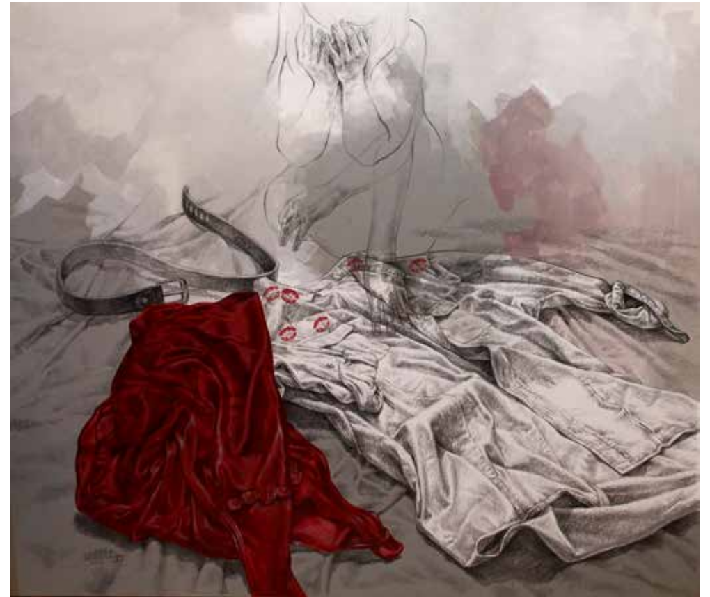
ILLEGAL KISSES | Pencil & Acrylic on canvas 130 x 150 cm , 2013 |