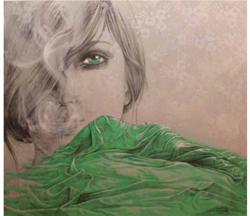
PRISONER OF HER EYES Pencil & Acrylic on canvas 130 x 150 cm , 2013