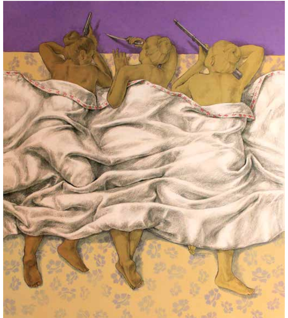
SOFT ANGER | Pencil & Acrylic on canvas 150 x 130 cm , 2013