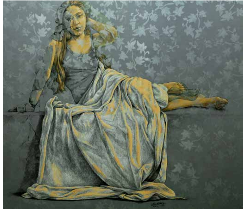
SILENCE OF SLOTH | Pencil & Acrylic on canvas 130 x 150 cm , 2013 |