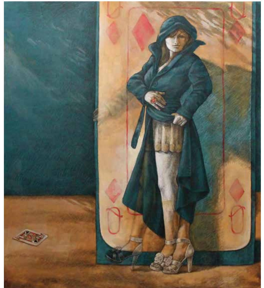
PAPER CARD GAMING | Pencil & Acrylic on canvas 150 x 130 cm , 2013