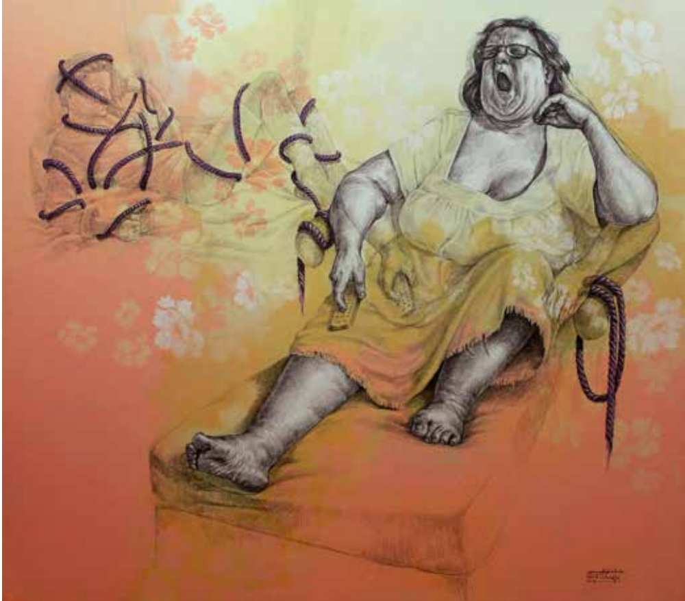
RESTRICTIONS OF SLOTH | Pencil & Acrylic on canvas 130 x 150 cm , 2013 |