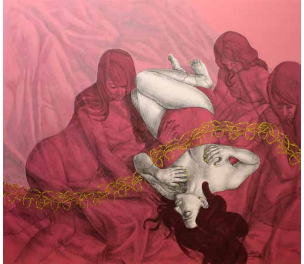
LUST OF A WOMAN | Pencil & Acrylic on canvas 130 x 150 cm , 2013